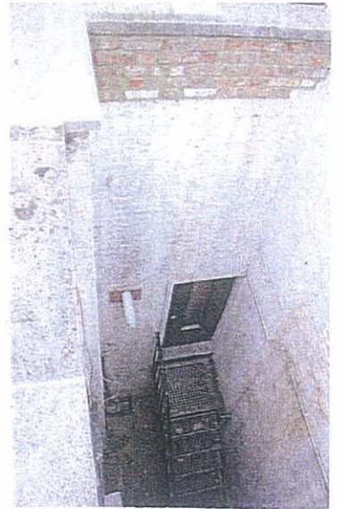
FIG 1.3 - VIEW OF LIGHTWELL STAIRCASE.