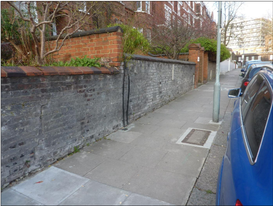
EXISTING FRONT WALL