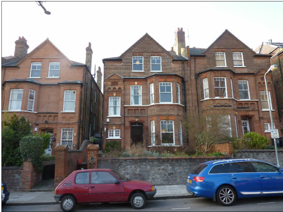
FRONT ELEVATION OF NOS. 14 AND 16 ORNAN ROAD