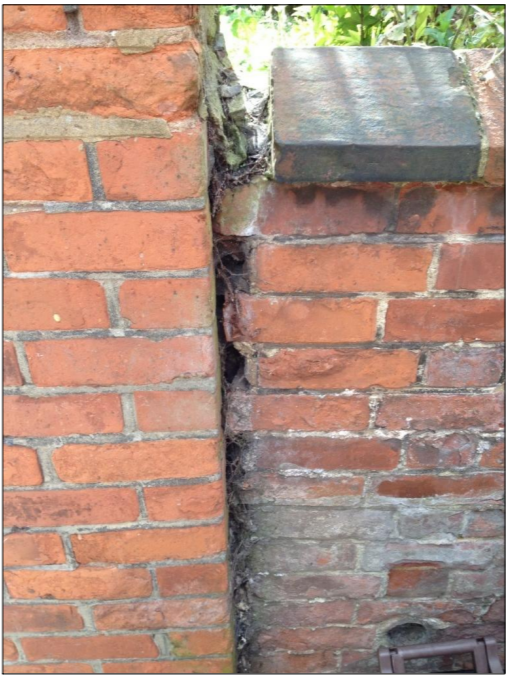
JUNCTION AT PIER