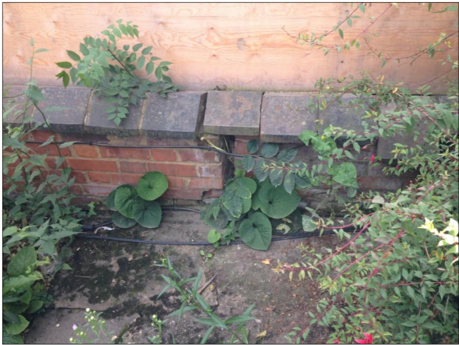
PARTY GARDEN WALL