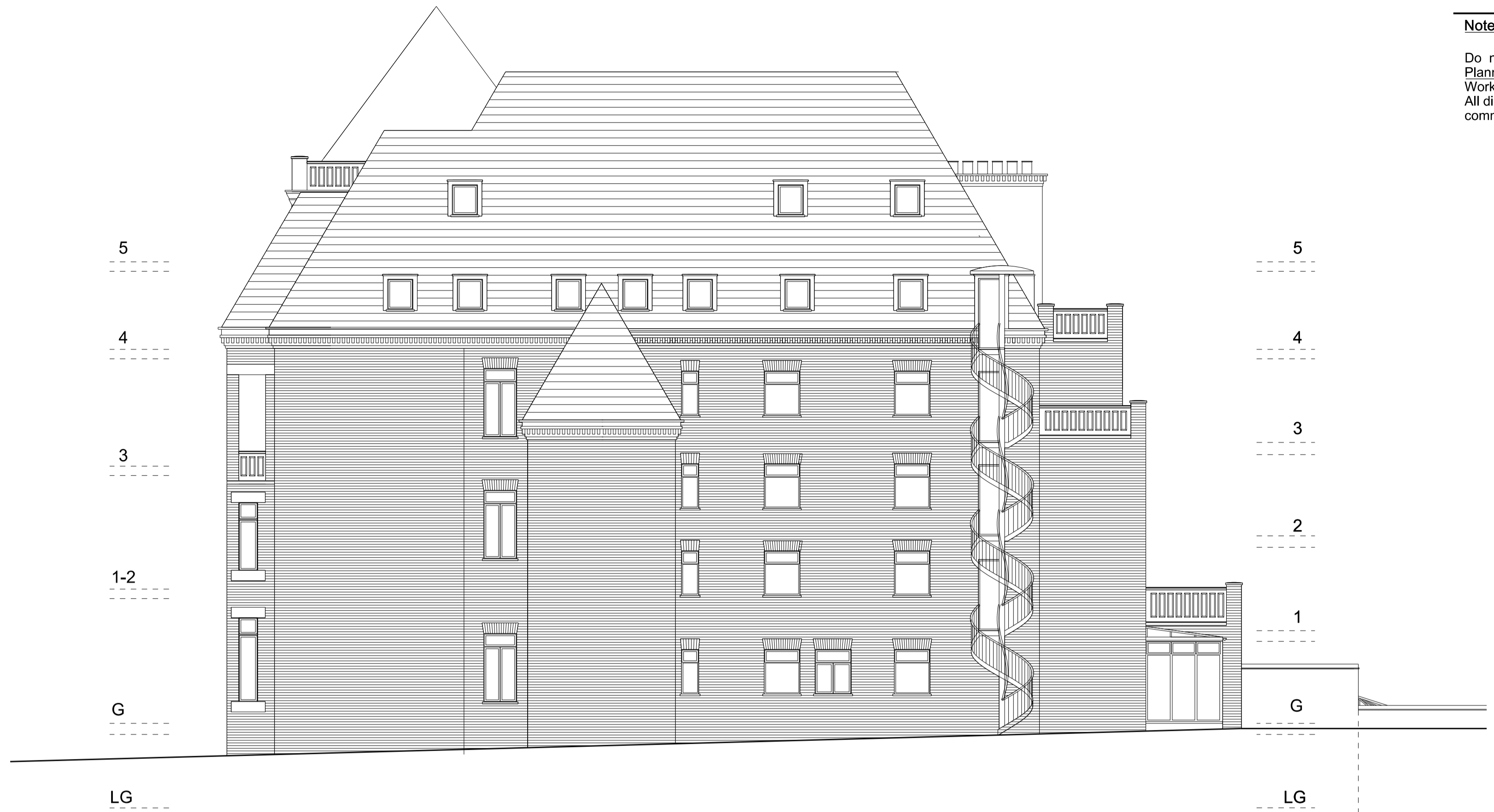
Existing Side (North) Elevation