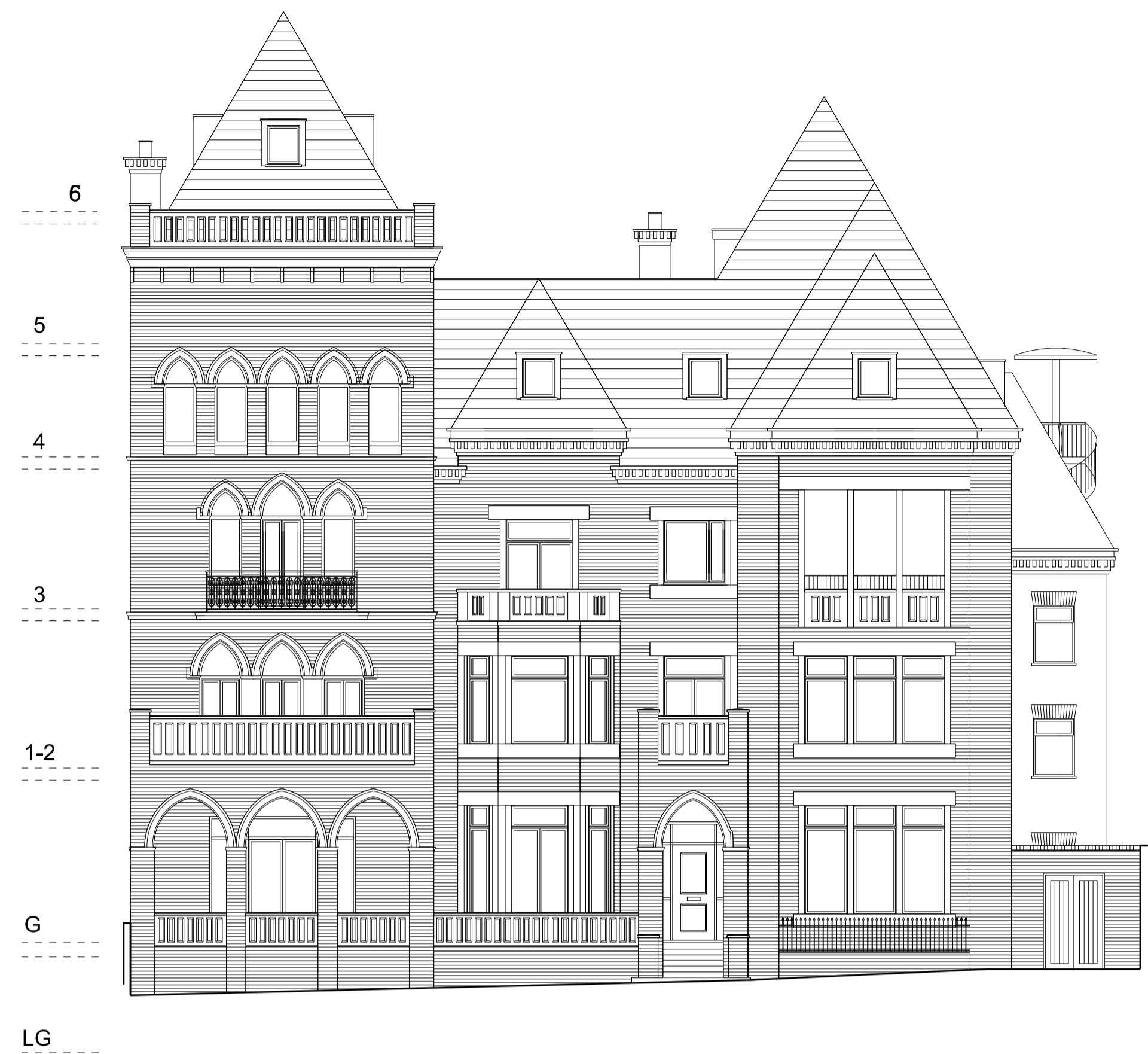
Existing Front (East) Elevation

Notes: Do not scale from this drawing except for Planning purposes. Work from figured dimensions only. All dimensions to be checked on site prior to commencement of work.