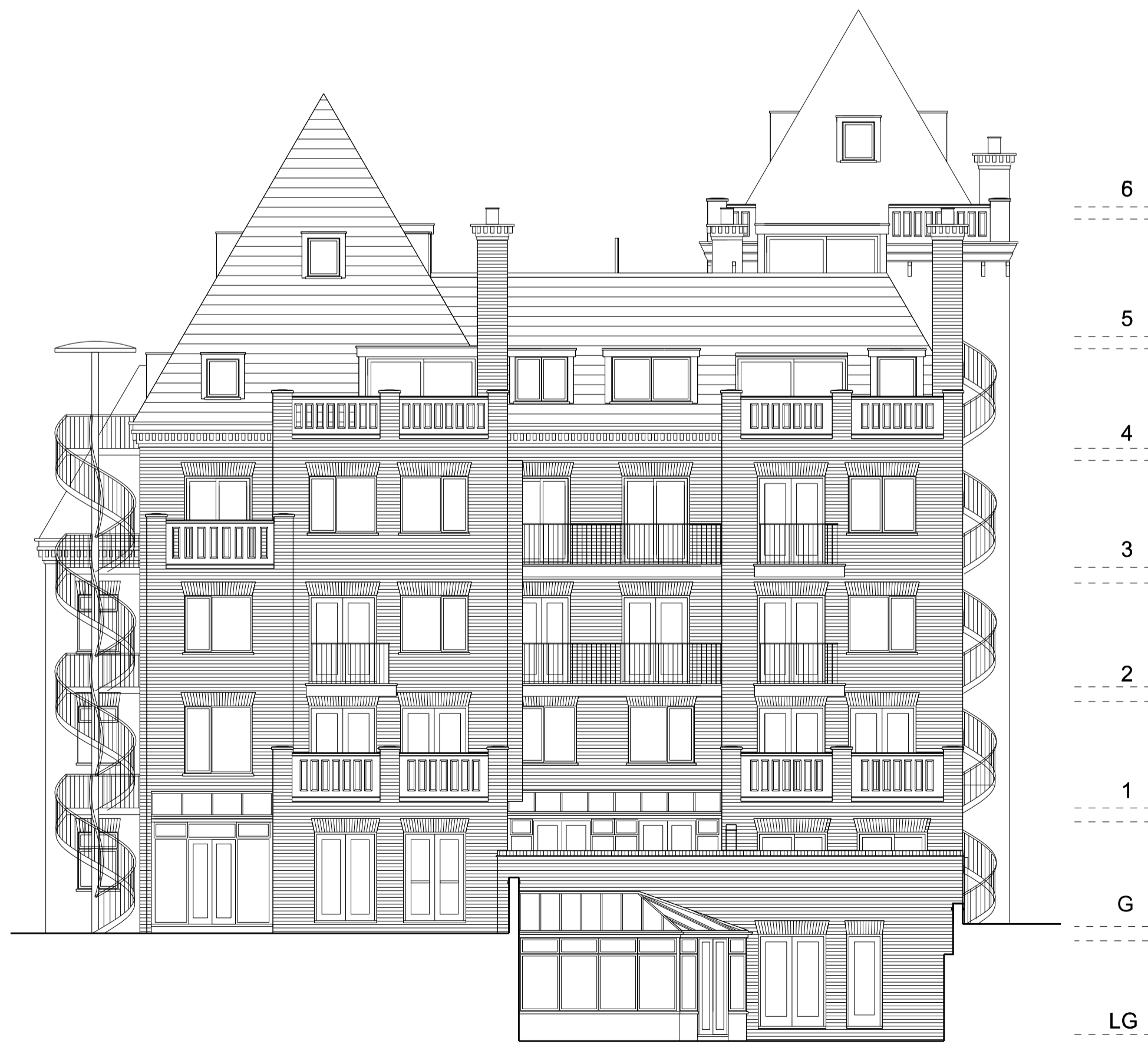
Existing Rear (West) Elevation