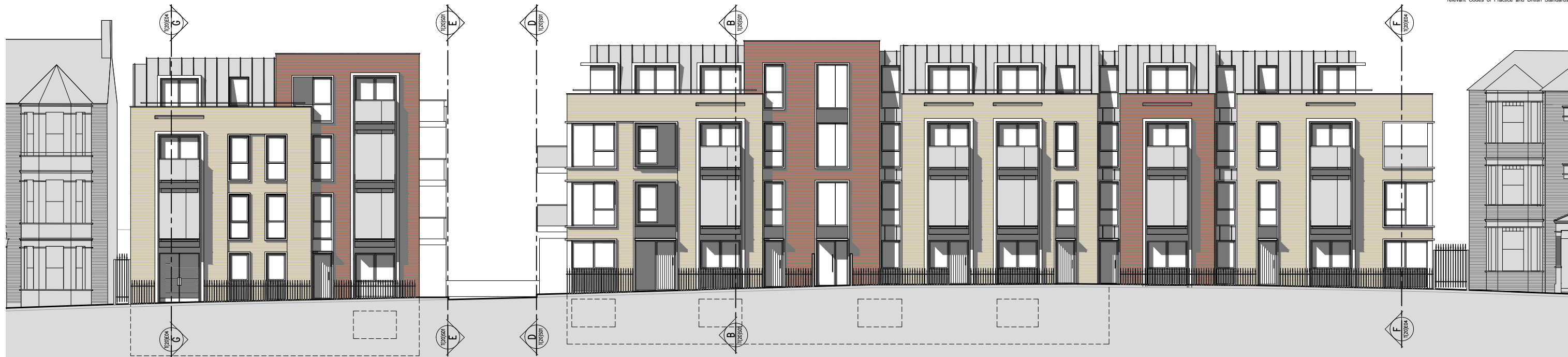
1 GONDAR GARDENS STREET ELEVATION 1-1 SCALE: 1:100 (A1)

Copyright Rolfe Judd Ltd NOTES 1 The Contractor must check and confirm all dimensions 2 All discrepancies must be reported and resolved by the Architect before works commence 3 This drawing is not to be scaled 4 All work and materials to be in accordance with current applicable Statutory Legislation and to comply with all relevant Codes of Practice and British Standards