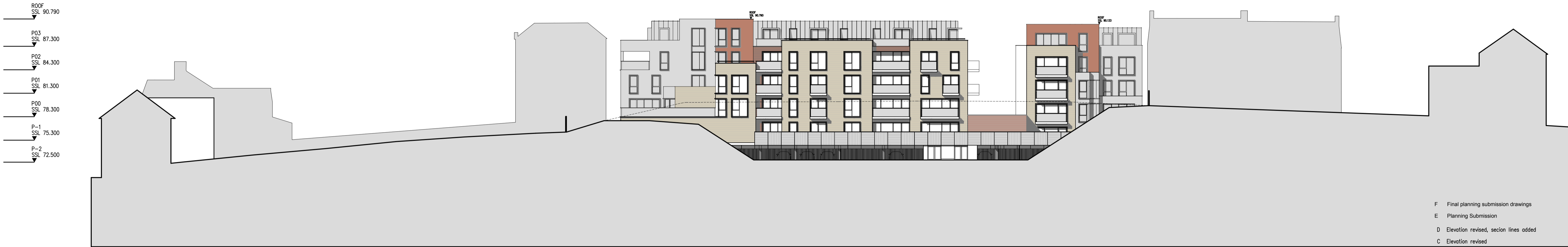
2 GONDAR GARDENS REAR ELEVATION 2-2 SCALE: 1:250 (A1)