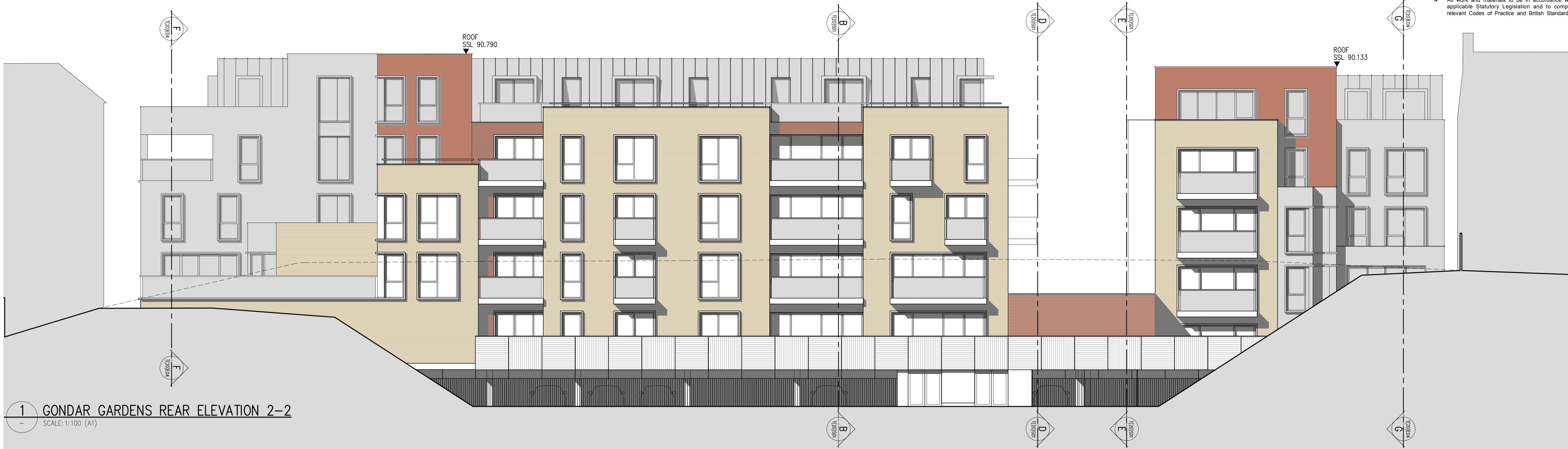
1 GONDAR GARDENS REAR ELEVATION 2-2 SCALE: 1:100 (A1)

Copyright Rolfe Judd Ltd NOTES 1 The Contractor must check and confirm all dimensions 2 All discrepancies must be reported and resolved by the Architect before works commence 3 This drawing is not to be scaled 4 All work and materials to be in accordance with current applicable Statutory Legislation and to comply with all relevant Codes of Practice and British Standards