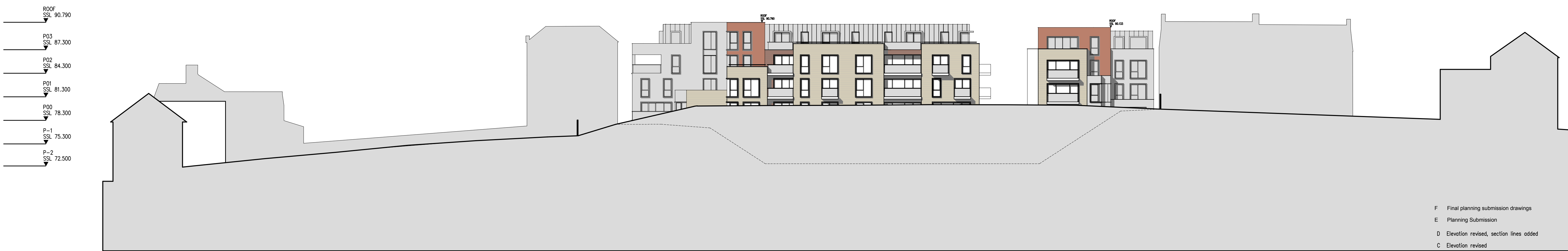
2 GONDAR GARDENS REAR ELEVATION 3-3 SCALE: 1:250 (A1)