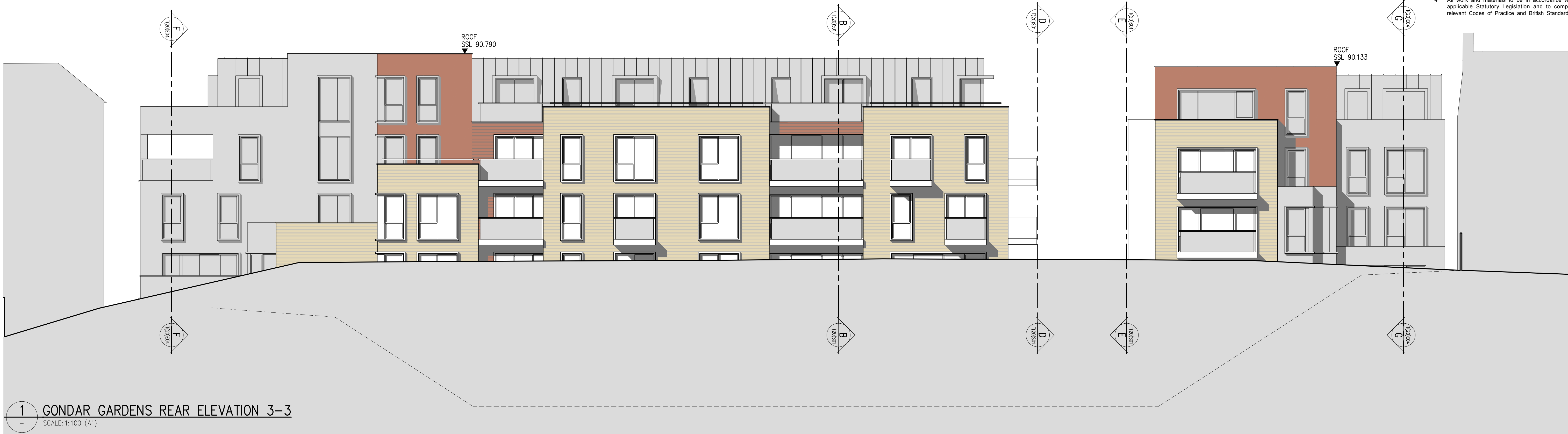
1 GONDAR GARDENS REAR ELEVATION 3-3 SCALE: 1:100 (A1)