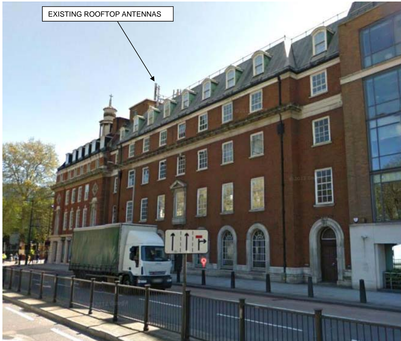
5:EUSTON ROAD LOOKING SOUTH EAST- EXISTING