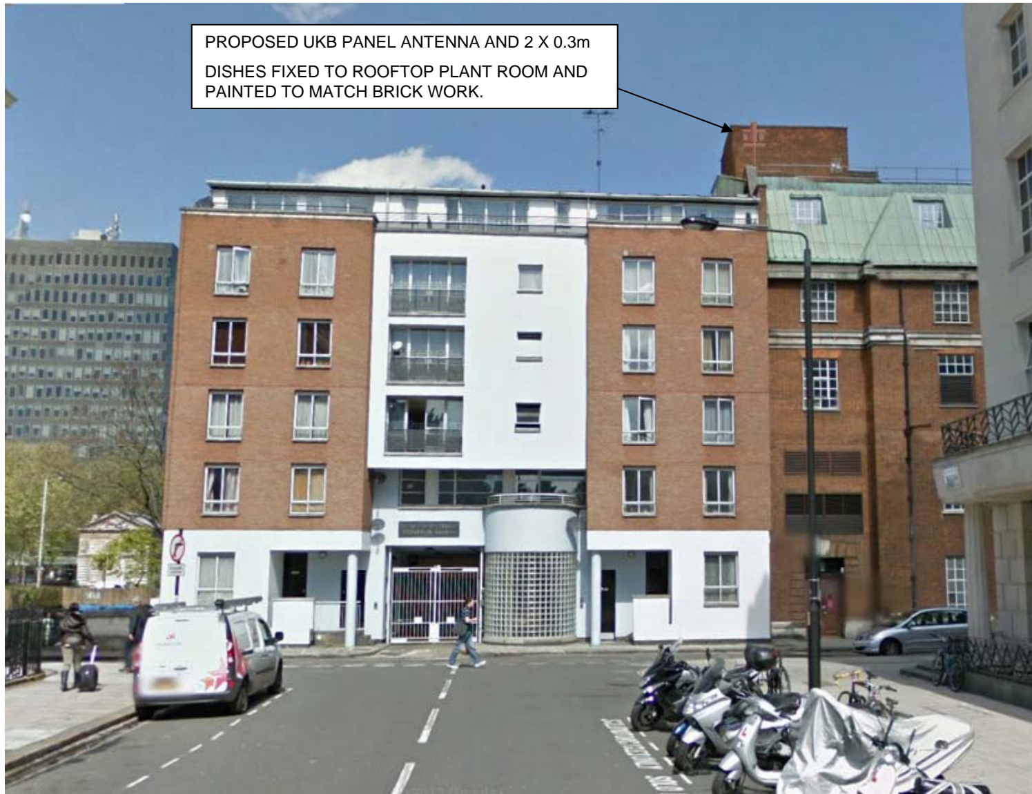
2: ENDSLEIGH RD LOOKING NORTH EAST- PROPOSED

PROPOSED UKB PANEL ANTENNA AND 2 X 0.3m DISHES FIXED TO ROOFTOP PLANT ROOM AND PAINTED TO MATCH BRICK WORK.