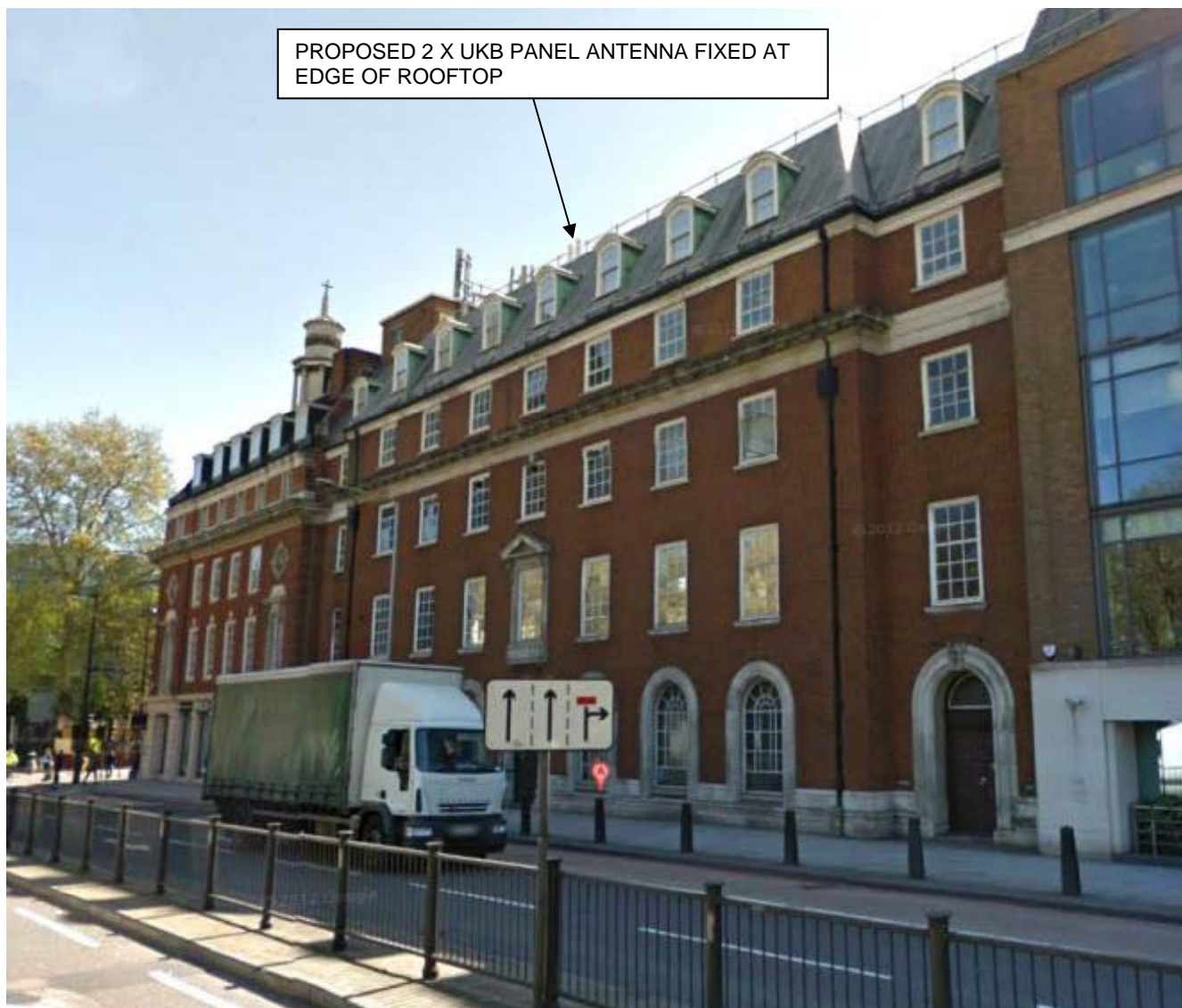
6:EUSTON ROAD LOOKING SOUTH EAST- PROPOSED