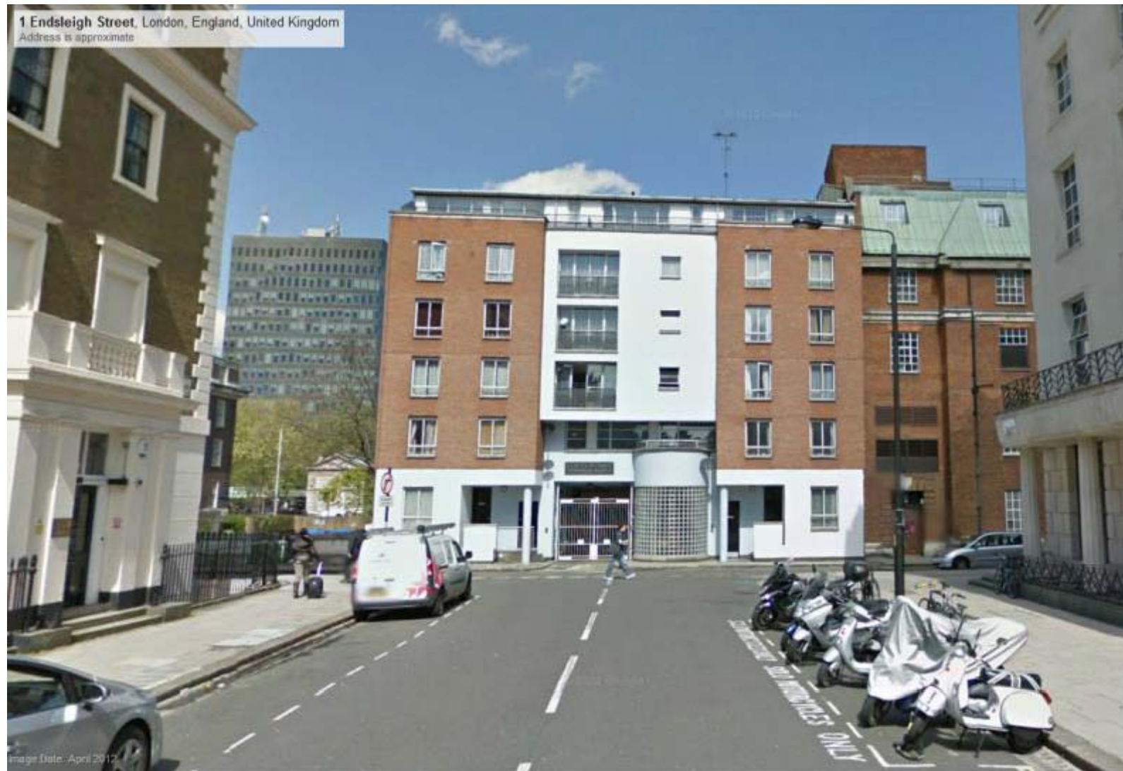
1: ENDSLEIGH RD LOOKING NORTH EAST – EXISTING