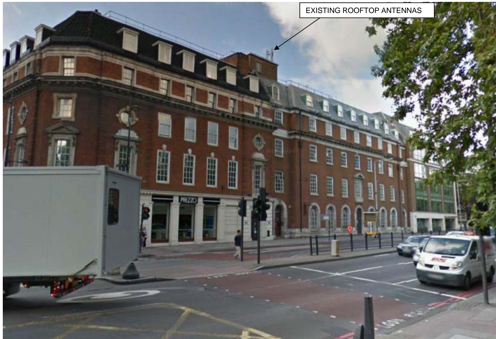
3:EUSTON ROAD LOOKING SOUTH WEST – EXISTING