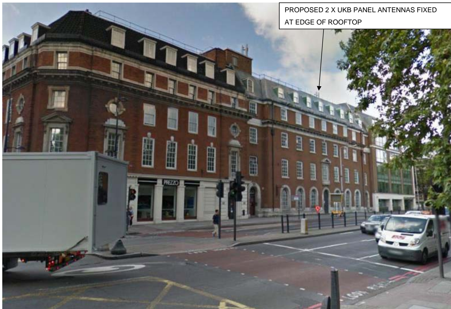
4:EUSTON ROAD LOOKING SOUTH WEST – PROPOSED.