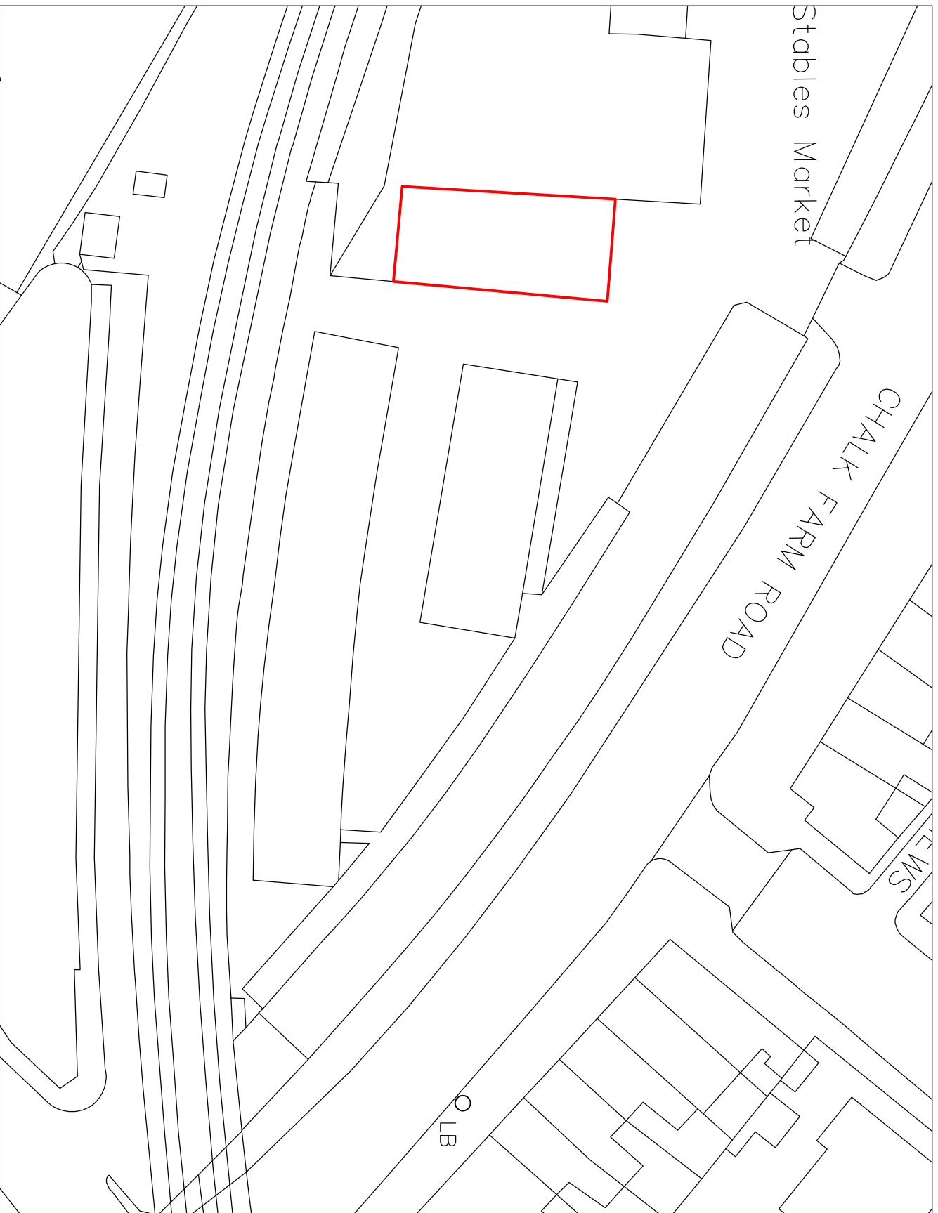
TACK ROOM (BLOCK D) SITE LOCATION PLAN, SCALE 1:500