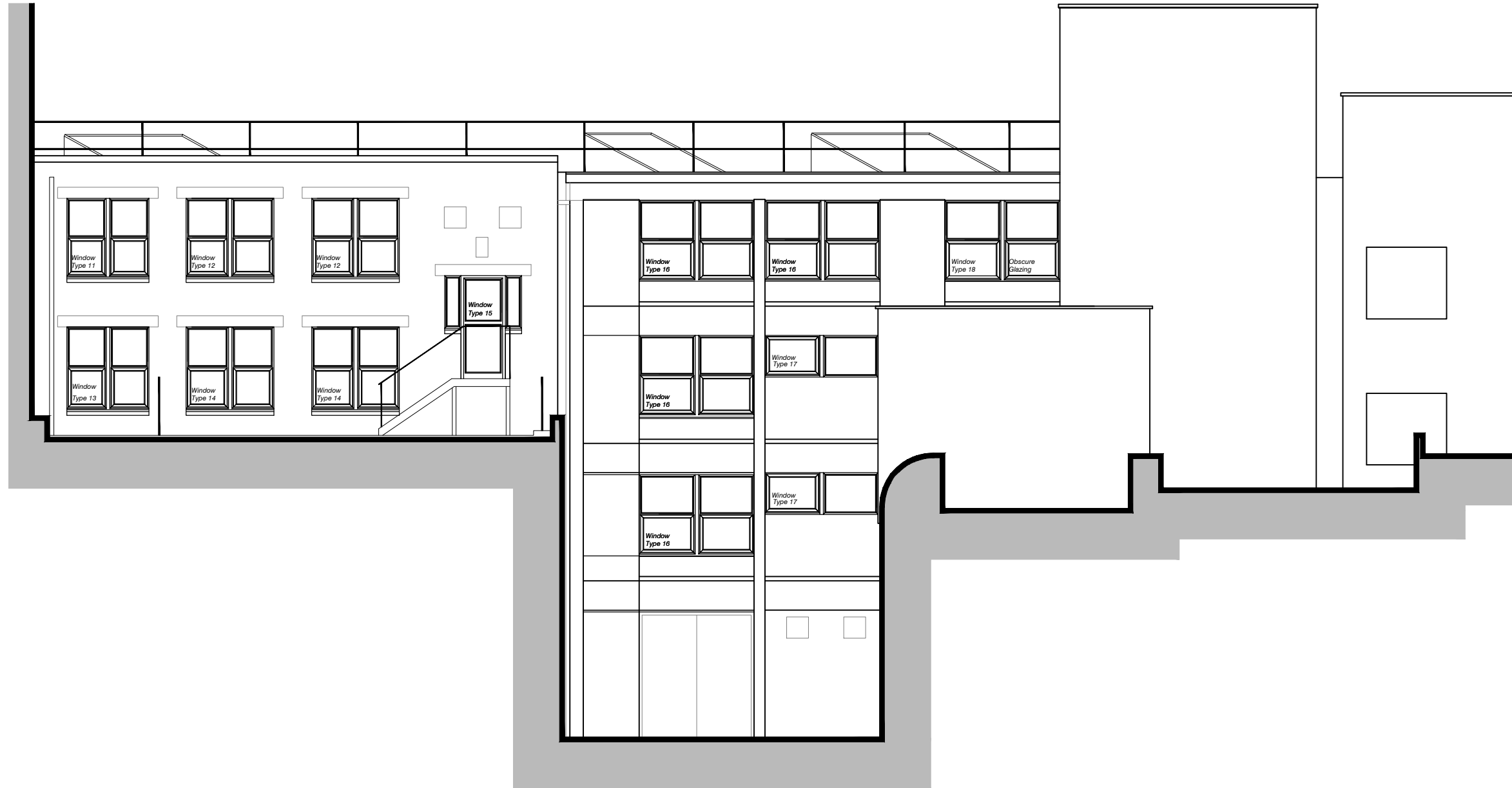
Proposed Elevation 2 Scale 1:100