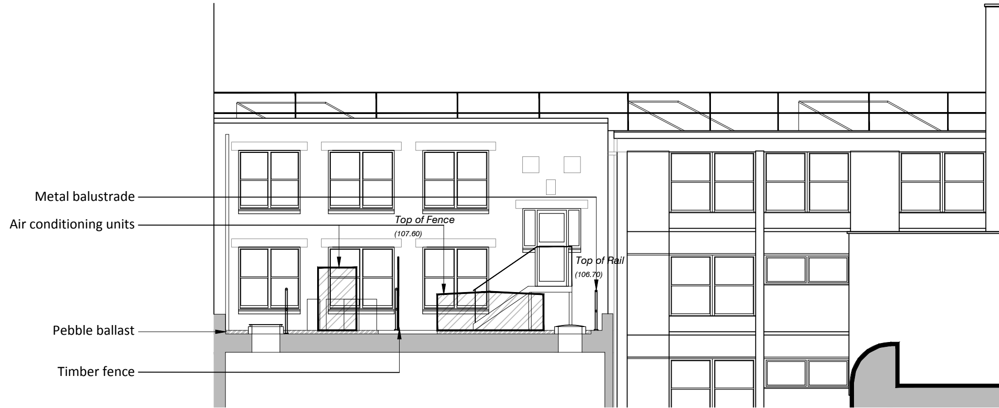
Existing Section B-B Scale 1:100