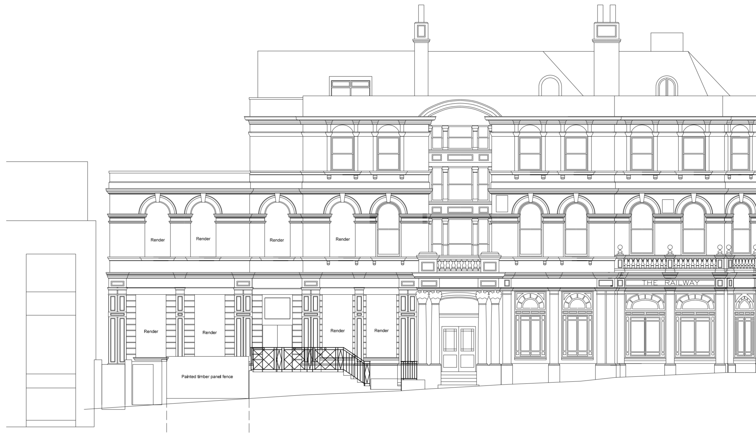
2 ELEVATION 2 103 north