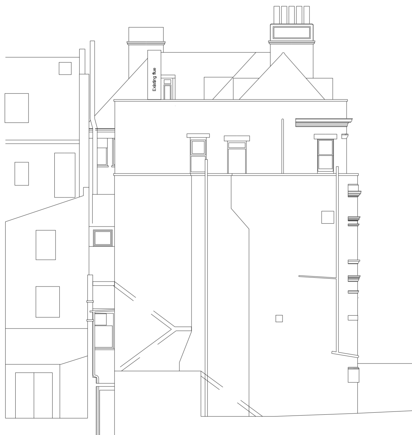
3 ELEVATION 3 103 east