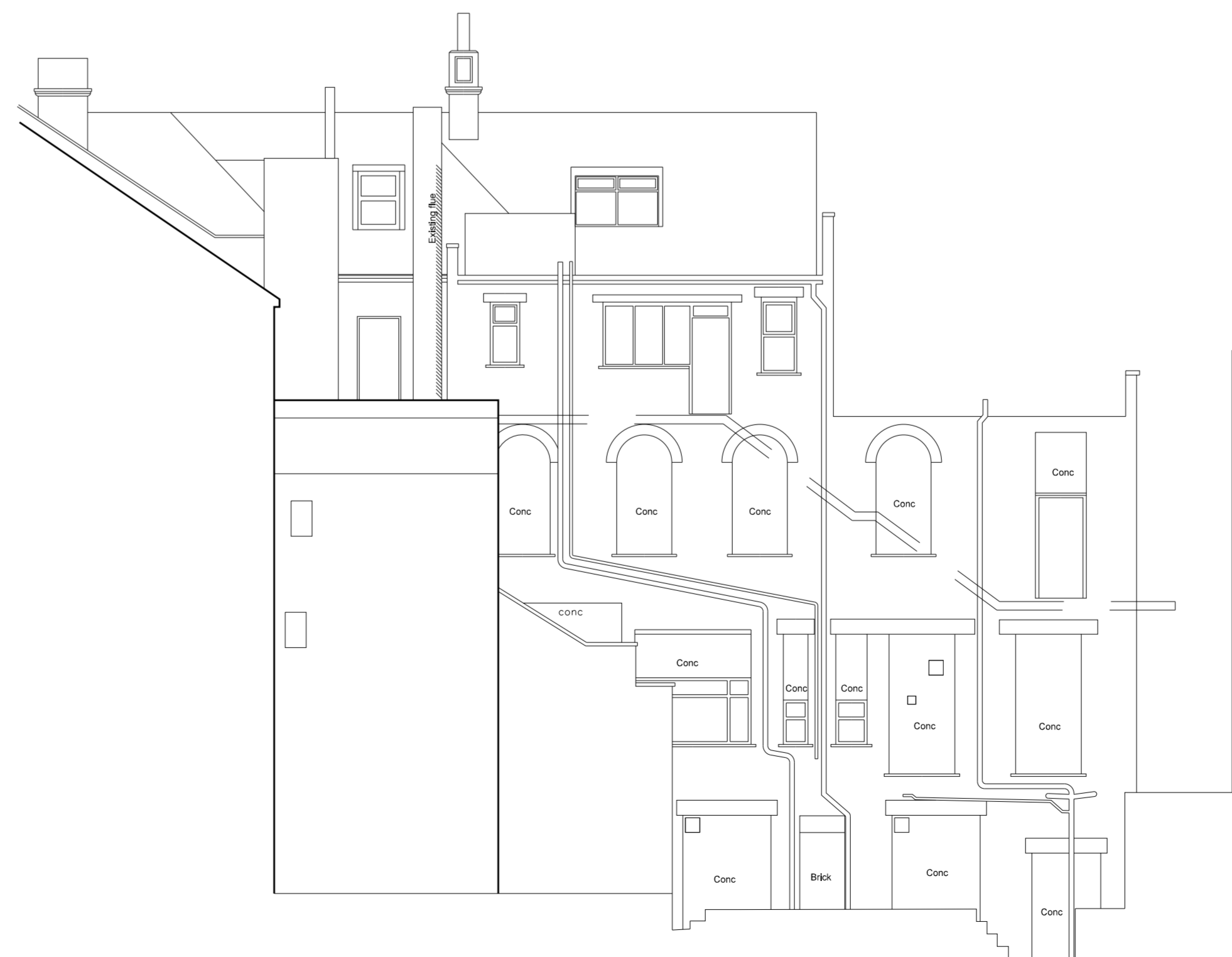
4 ELEVATION 4 103 south