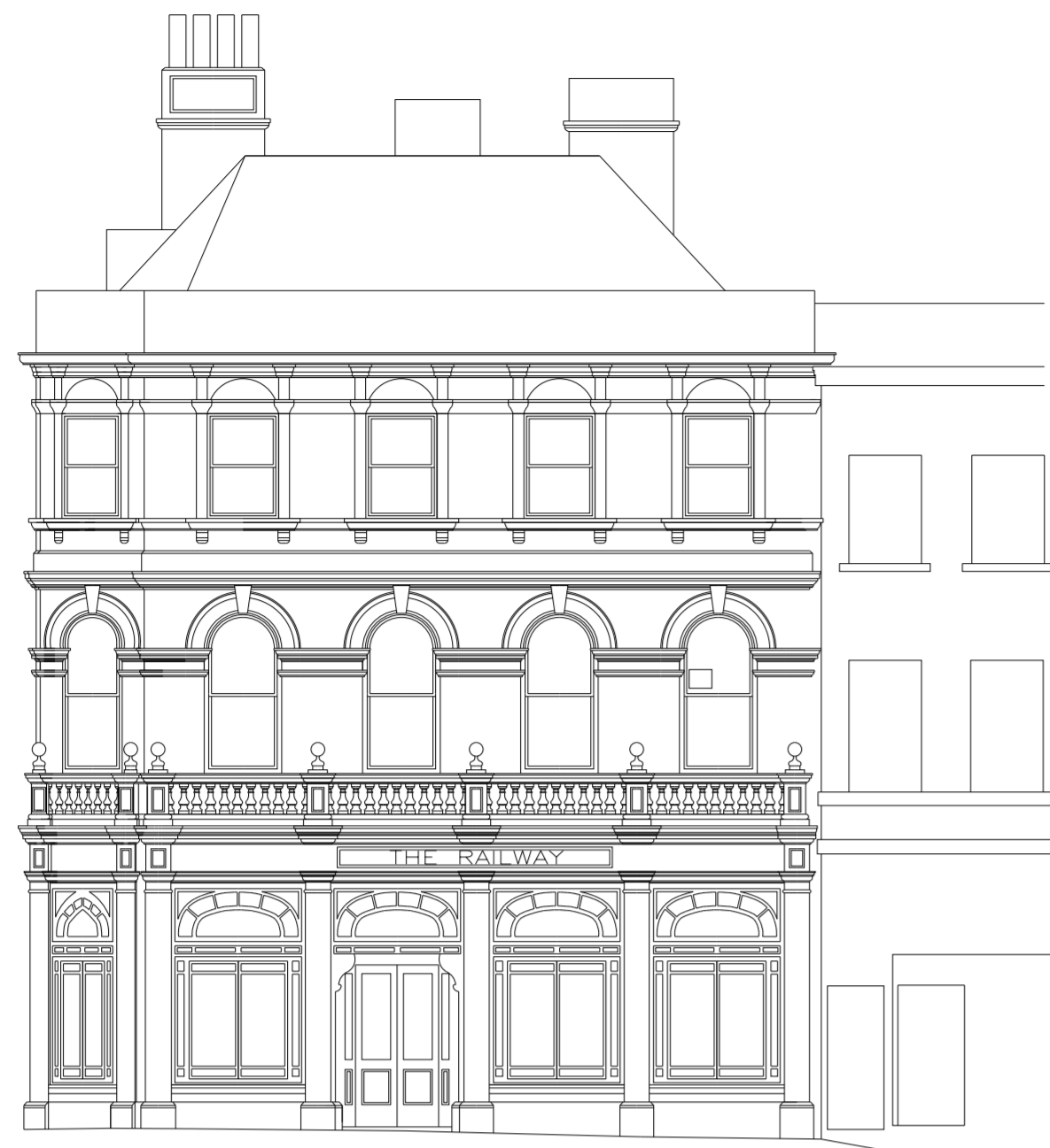
1 ELEVATION 1 103 west