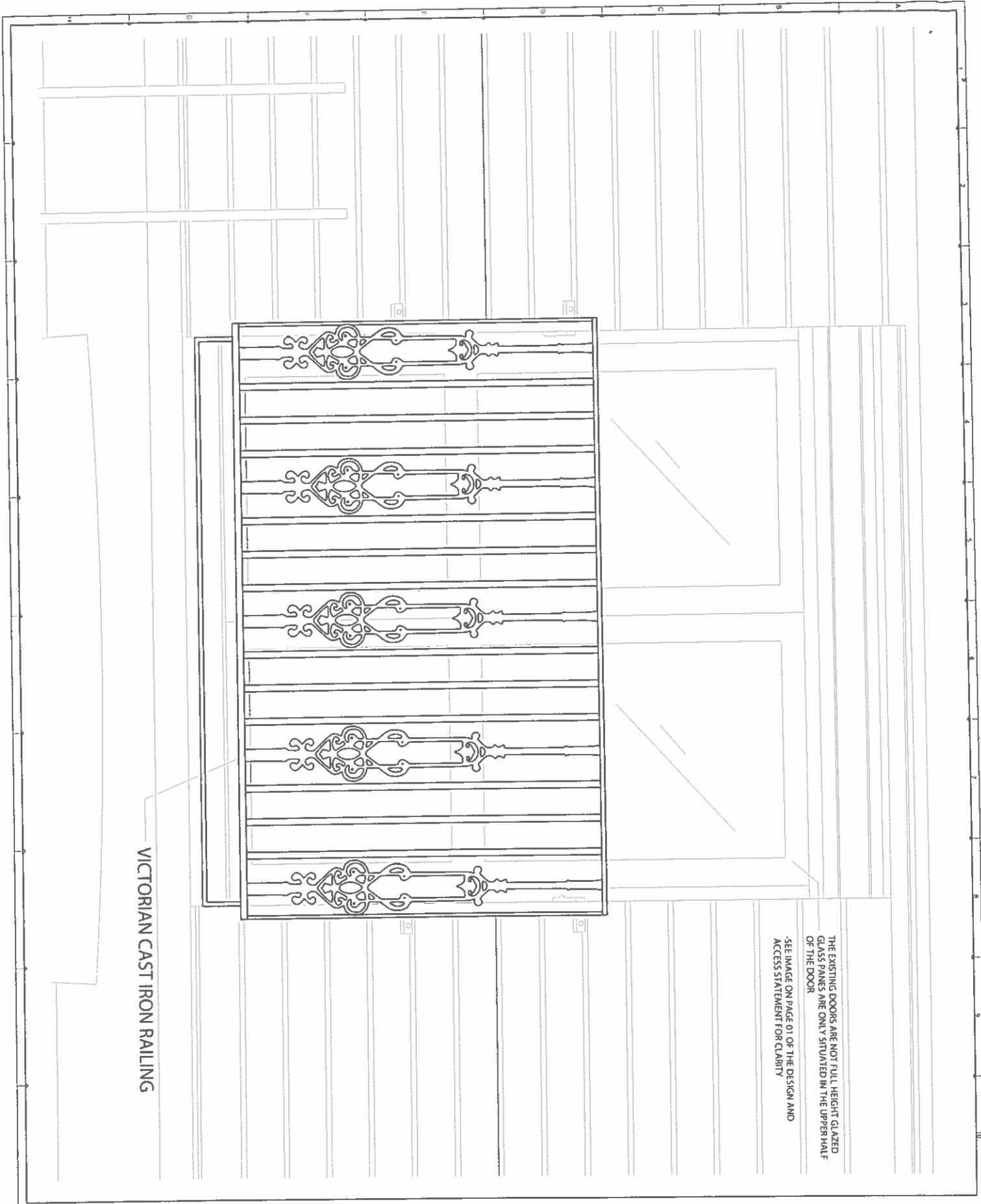
VICTORIAN CAST IRON RAILING

THE EXISTING DOORS ARE NOT FULL HEIGHT GLAZED GLASS PANEES ARE ONLY SITUATED IN THE UPPER HALF OF THE DOOR -SEE IMAGE ON PAGE 01 OF THE DESIGN AND ACCESS STATEMENT FOR CLARITY