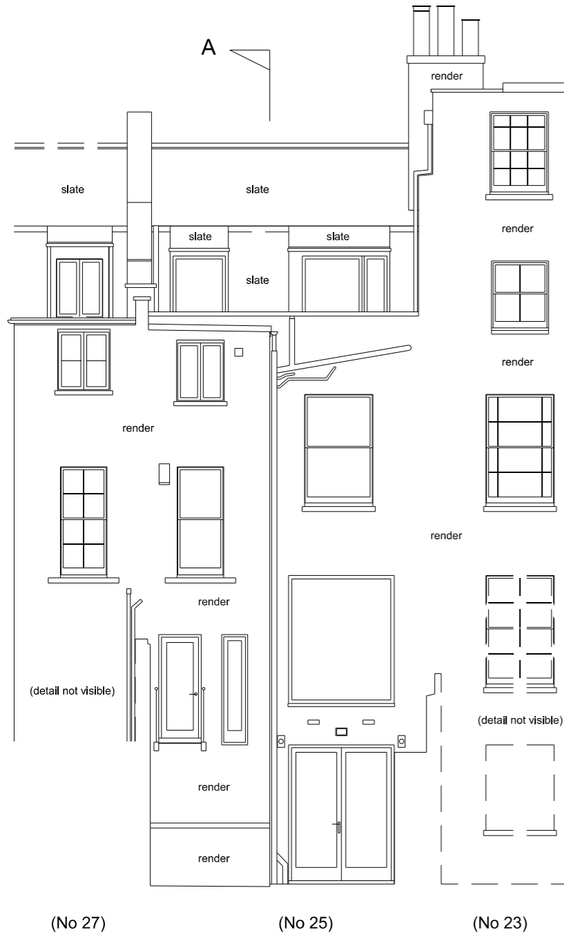
(No 27) (No 25) (No 23)

1. The drawings show design intent only. All dimensions to be checked on site prior to construction or production. Construction details to be confirmed by contractor/manufacturer by submitting shop drawings for designer's approval. 2. Design drawings not to be scaled for production and construction purposes. 3. All discrepancies and omissions on site must be reported to designer for their comment or approval prior to commencing work. 4. The designs are subject to approval by statutory authorities and any necessary alterations should be made if required to comply with statutory requirements. Do not scale from this drawing. This drawing is not based on an accurate survey. DMR do not accept responsibility for dimensions taken from this drawing. Contractor to check all building and site dimensions. This drawing is to be read and checked in conjunction with engineer's and other specialist drawings. The drawing and the works depicted are the copyright of this practice and may not be reproduced except by written permission. Rev Date Notes