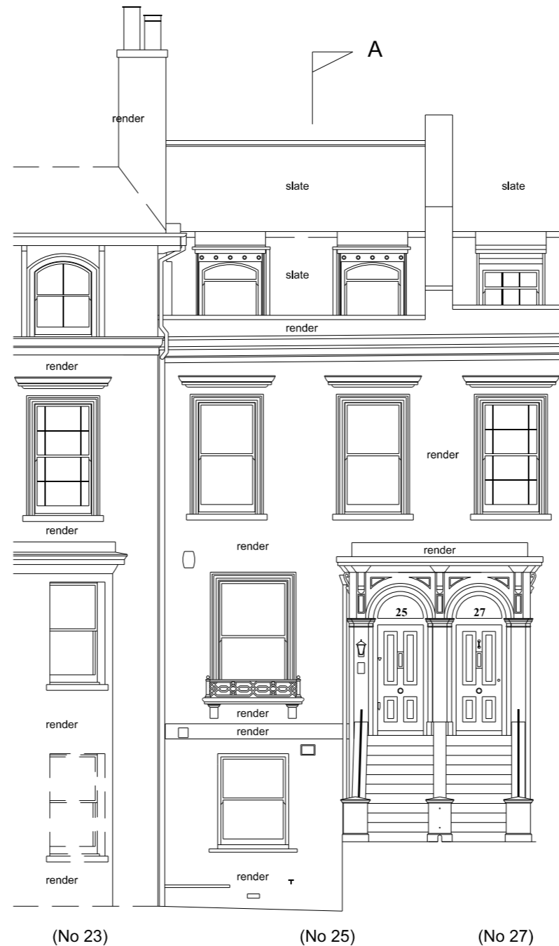
(No 23) (No 25) (No 27)