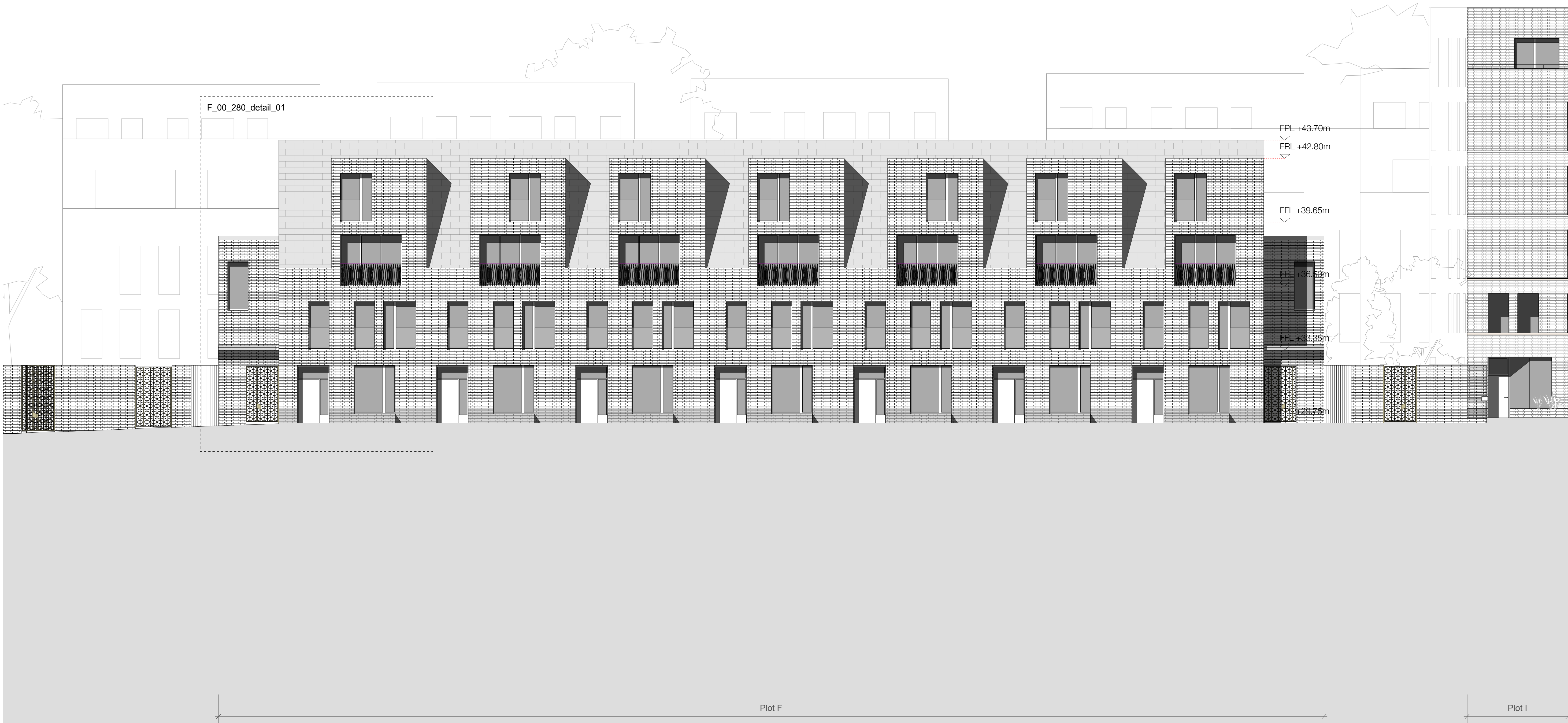
01 Long elevation Plot F

NOTES: 1. Measurements are based on metric system 2. All levels are in metres to Principal Datum (PD) unless noted otherwise 3. Do not scale drawing 4. Figure dimensions are to be followed 5. Do not use for construction unless expressly permitted 6. Contractor should verify all conditions on site and notify contract administrator of any variations from dimensions before construction 7. Internal furniture is indicative only The data contained in this document includes proprietary rights of mae. Any party in receipt of the document shall receive and hold the same in confidence and agrees not to duplicate or otherwise reproduce the document in whole or in part, nor disclose the contents of the same without the written consent of mae.