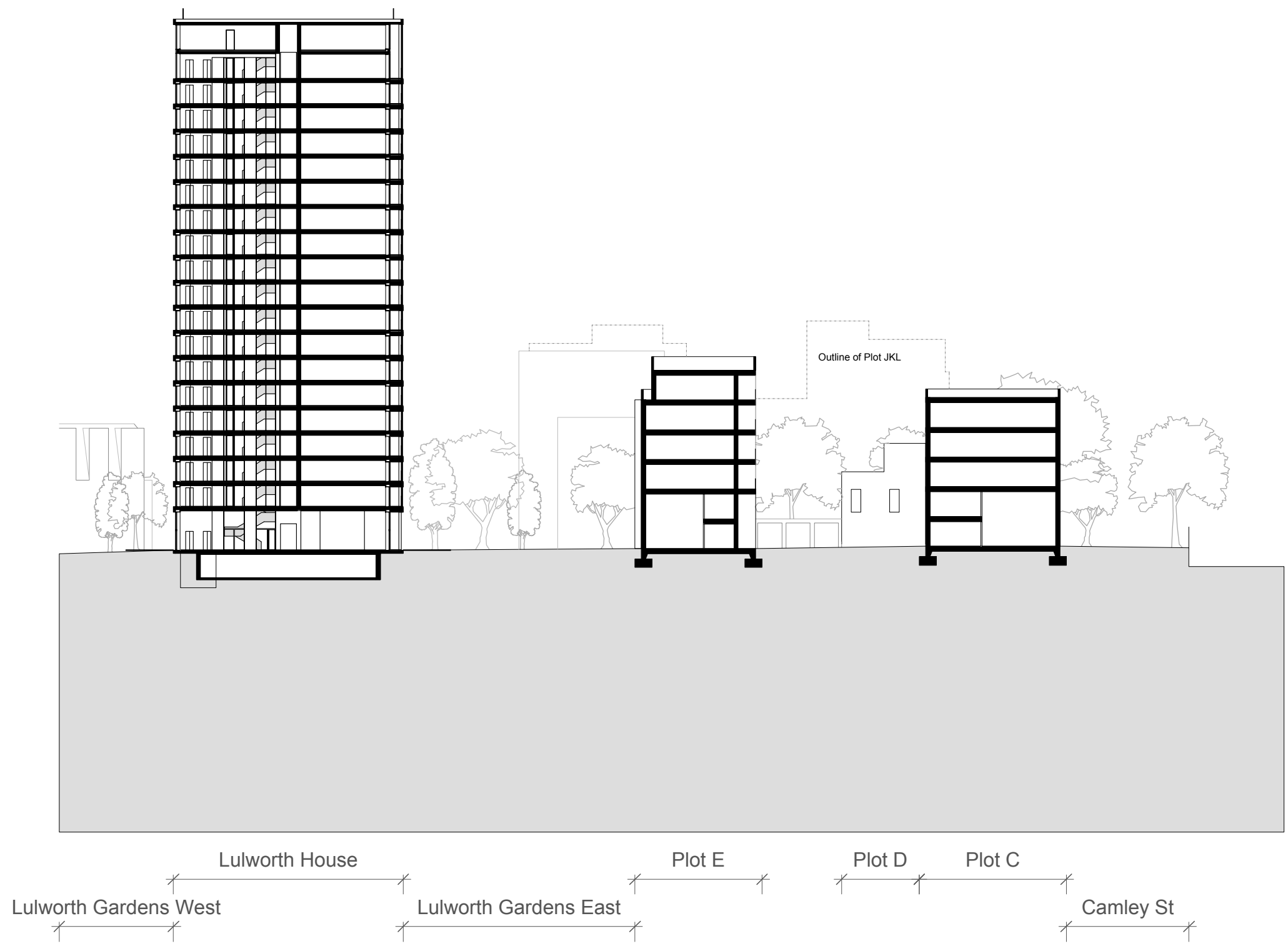
02 Proposed Site Section FF