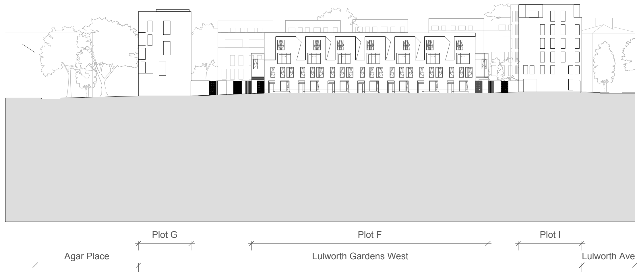
03 Proposed Site Section GG