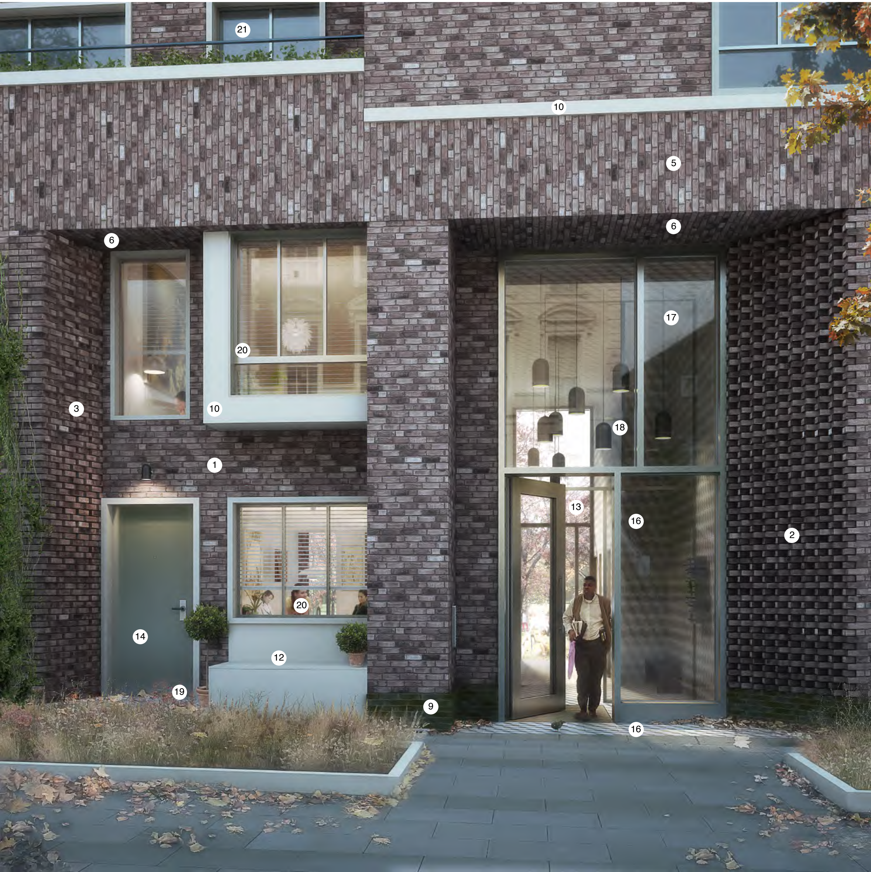
01 Plot JKL Communal Entrance and Maisonette Entrance on Agar Grove