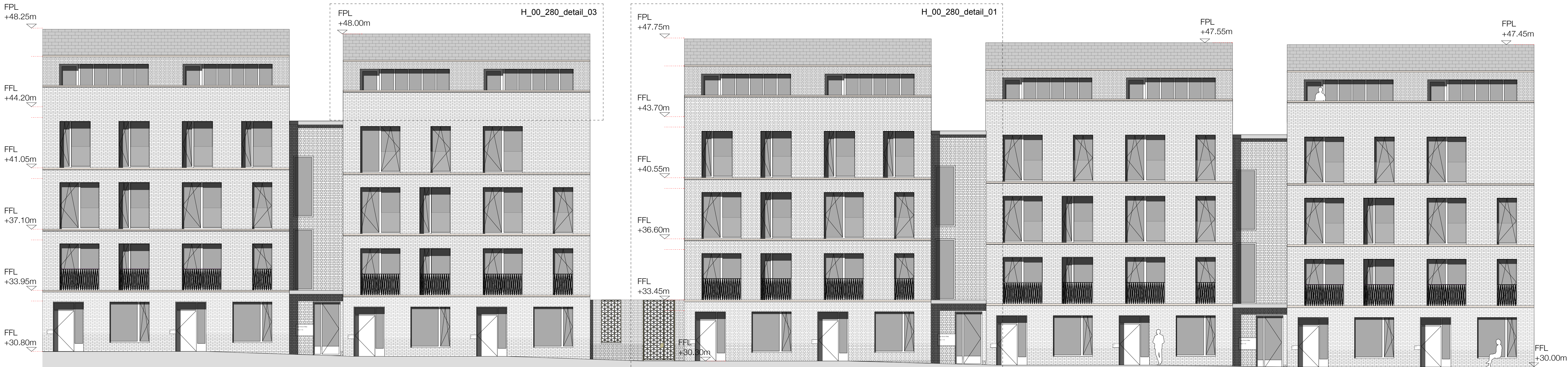
01 North elevation

NOTES: 1. Measurements are based on metric system 2. All levels are in meters to Principal Datum (PD) unless noted otherwise 3. Do not scale drawing 4. Figure dimensions are to be followed 5. Do not use for construction unless expressly permitted 6. Contractor should verify all conditions on site and notify contract administrator of any variations from dimensions before construction 7. Internal furniture is indicative only