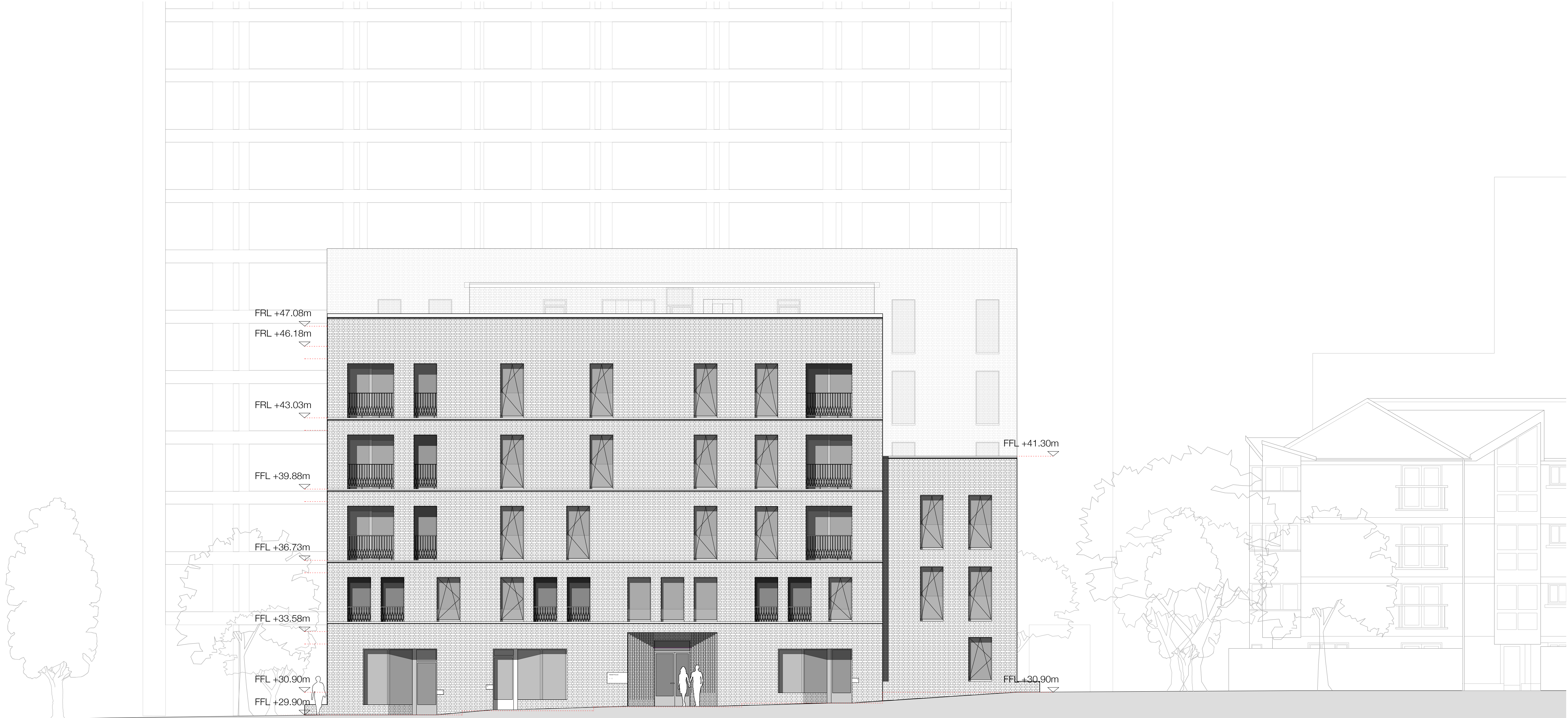
01 East elevation

NOTES: 1. Measurements are based on metric system 2. All levels are in meters to Principal Datum (PD) unless noted otherwise 3. Do not scale drawing 4. Figure dimensions are to be followed 5. Do not use for construction unless expressly permitted 6. Contractor should verify all conditions on site and notify contract administrator of any variations from dimensions before construction