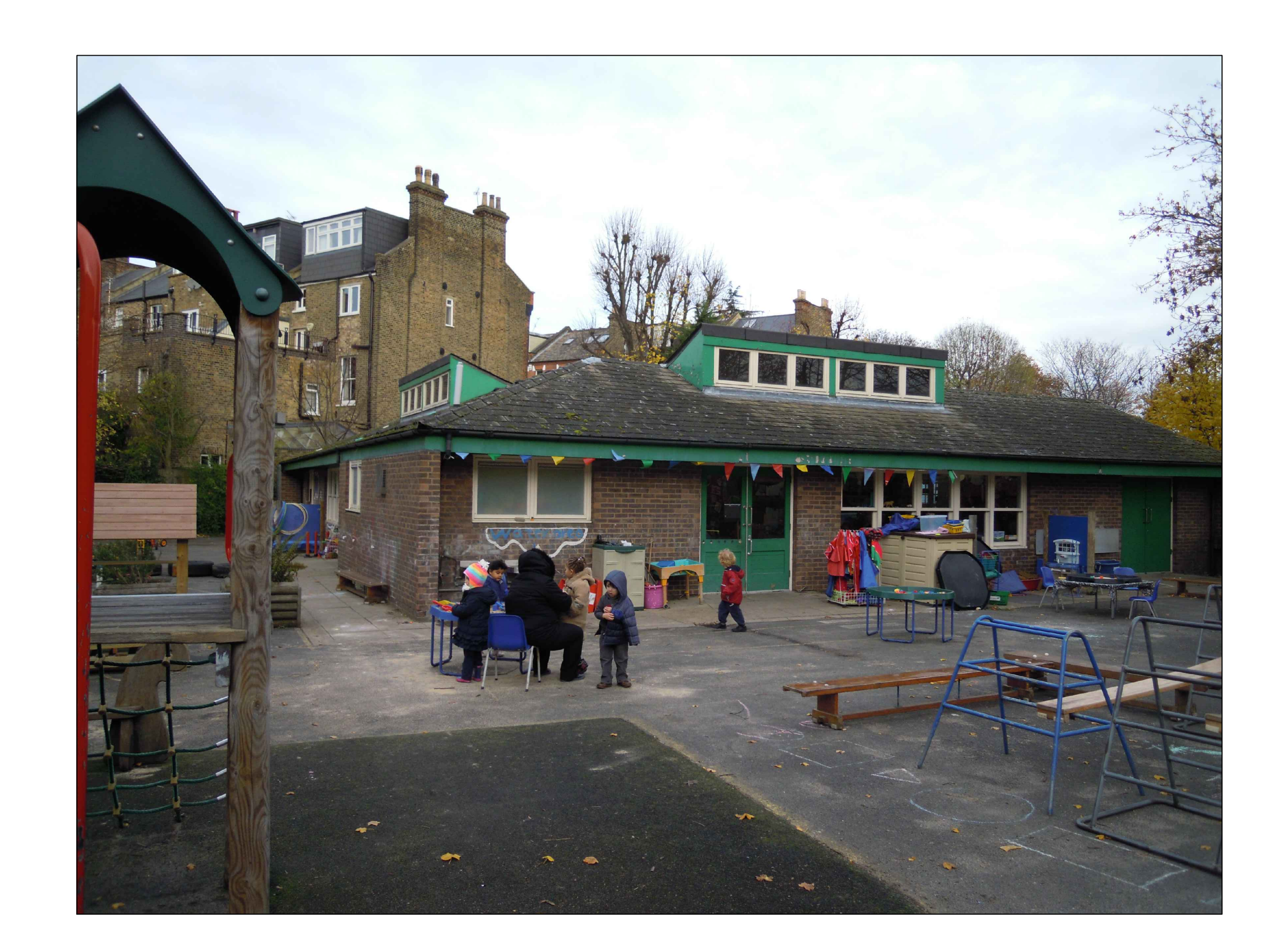
02 EXISTING VIEW OF NURSERY FROM INSIDE PLAY AREA