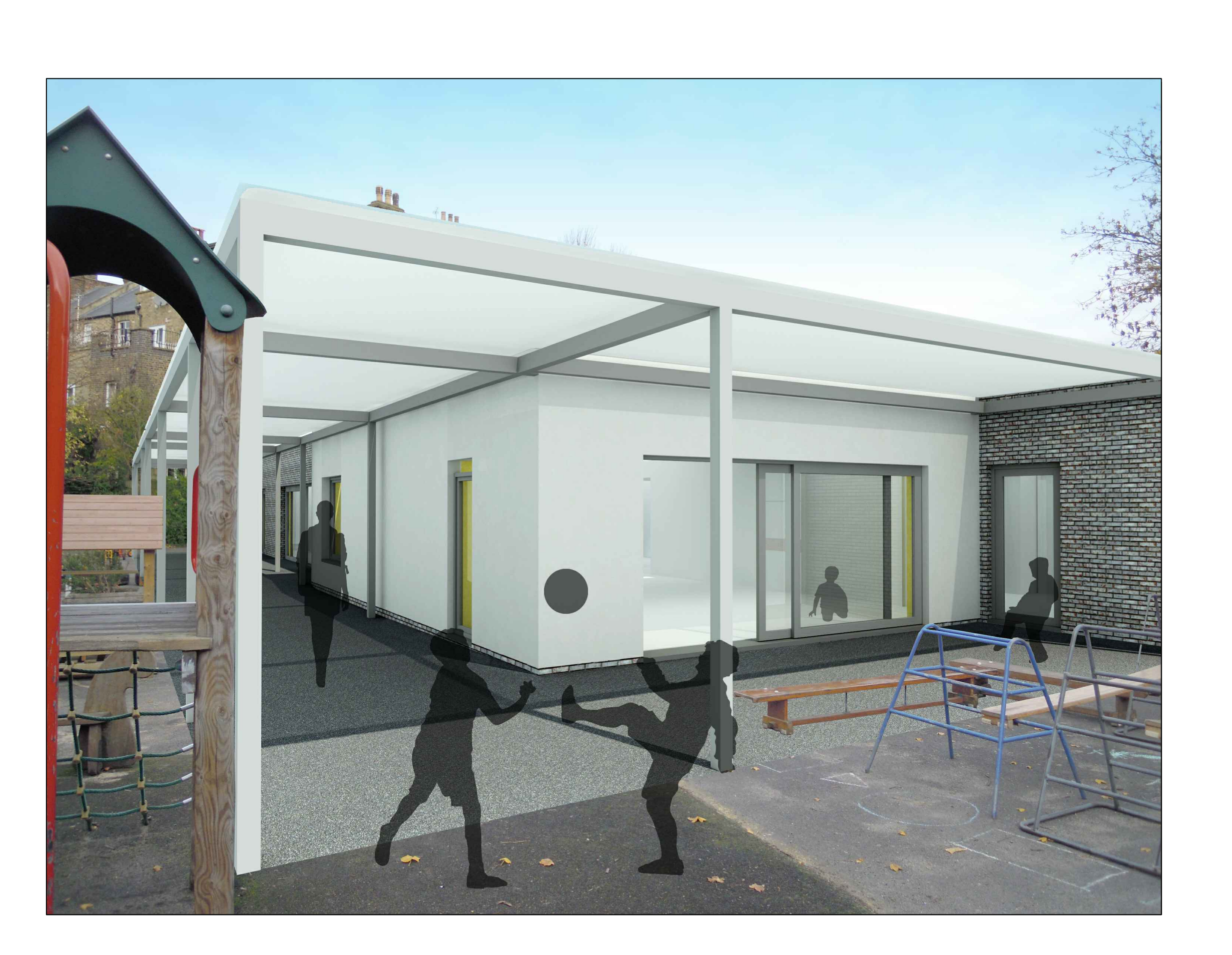
02 PROPOSED VIEW OF EYFS FROM INSIDE PLAY AREA