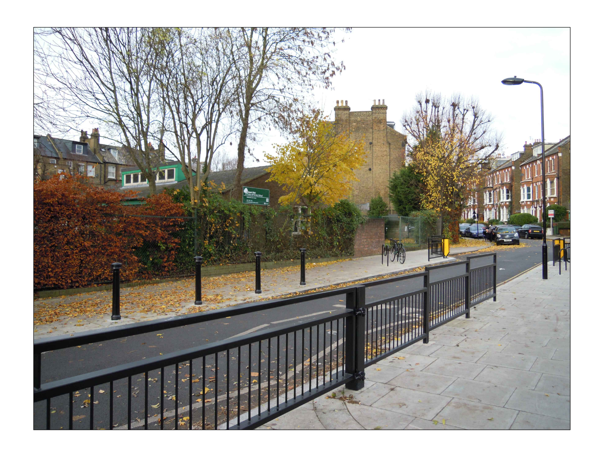
01 EXISTING VIEW OF NURSERY FROM SAVERNAKE ROAD