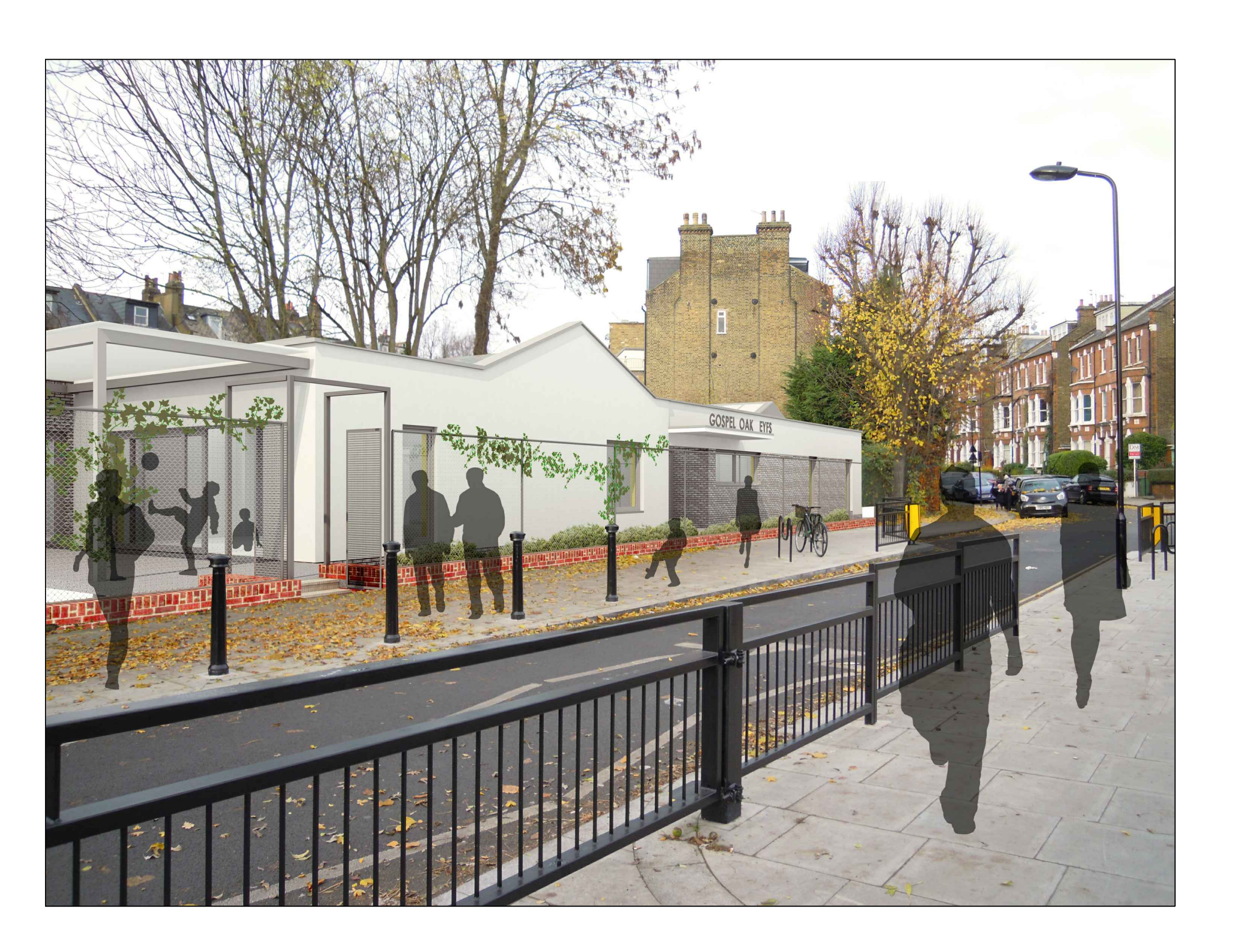
01 PROPOSED VIEW OF EYFS FROM SAVERNAKE ROAD