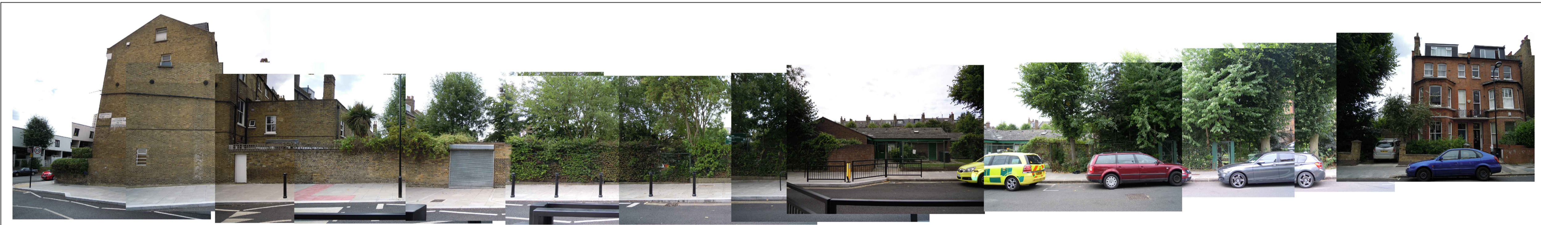
02 SAVERNAKE ROAD PHOTO PANORAMA - EXISTING STREET ELEVATION