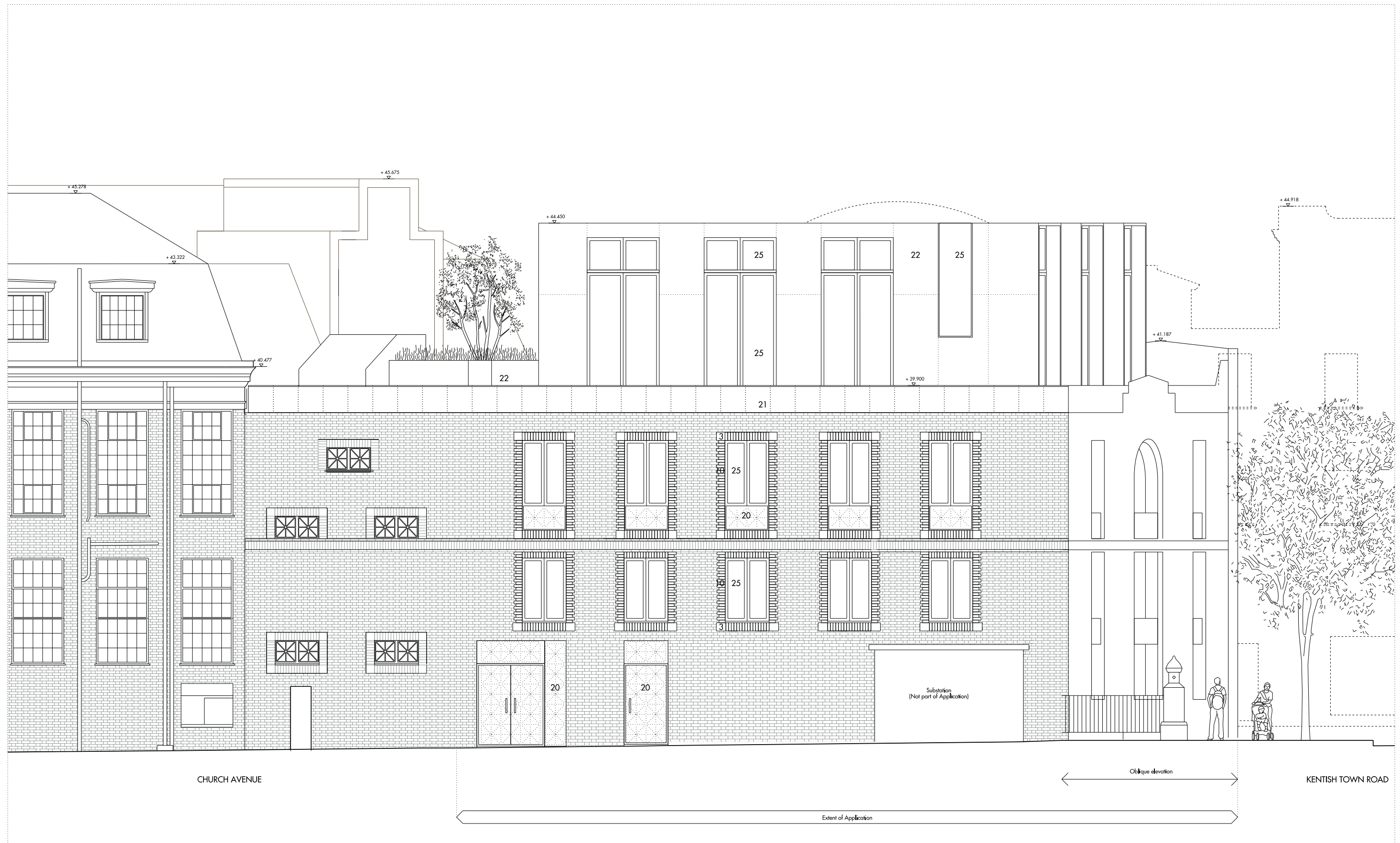
01 PROPOSED SOUTH ELEVATION SCALE 1:50 @ A1