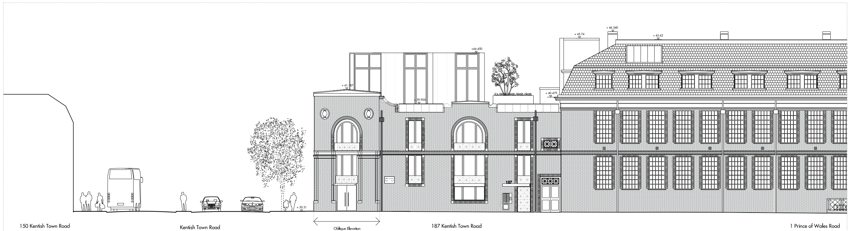
01 PROPOSED NORTH STREETSCAPE ELEVATION SCALE 1:100 @ A1