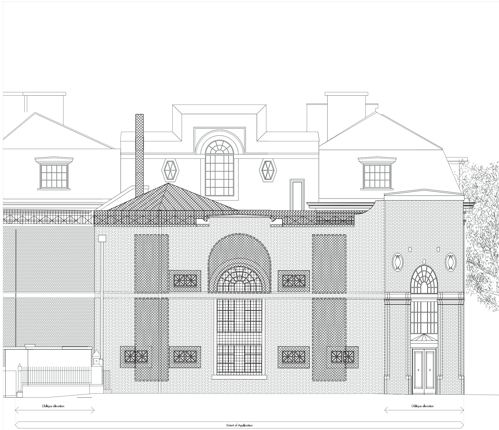
01 EAST ELEVATION SCALE 1:50 @ A1