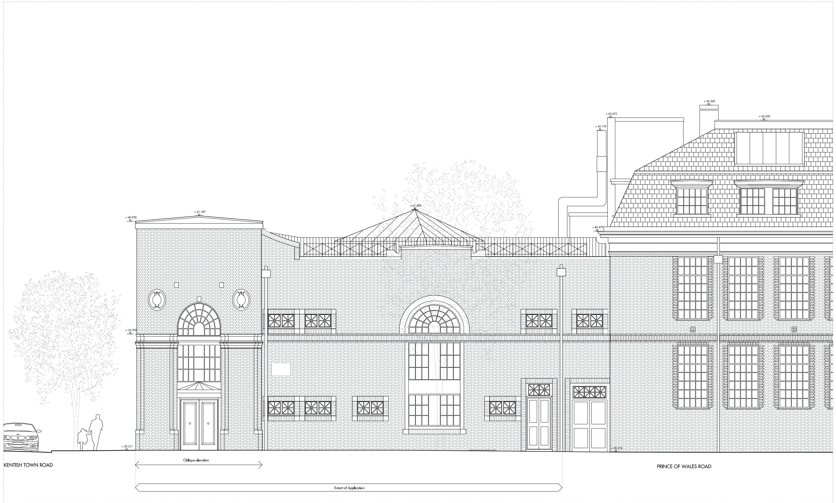
01 NORTH ELEVATION SCALE 1:50 @ A1