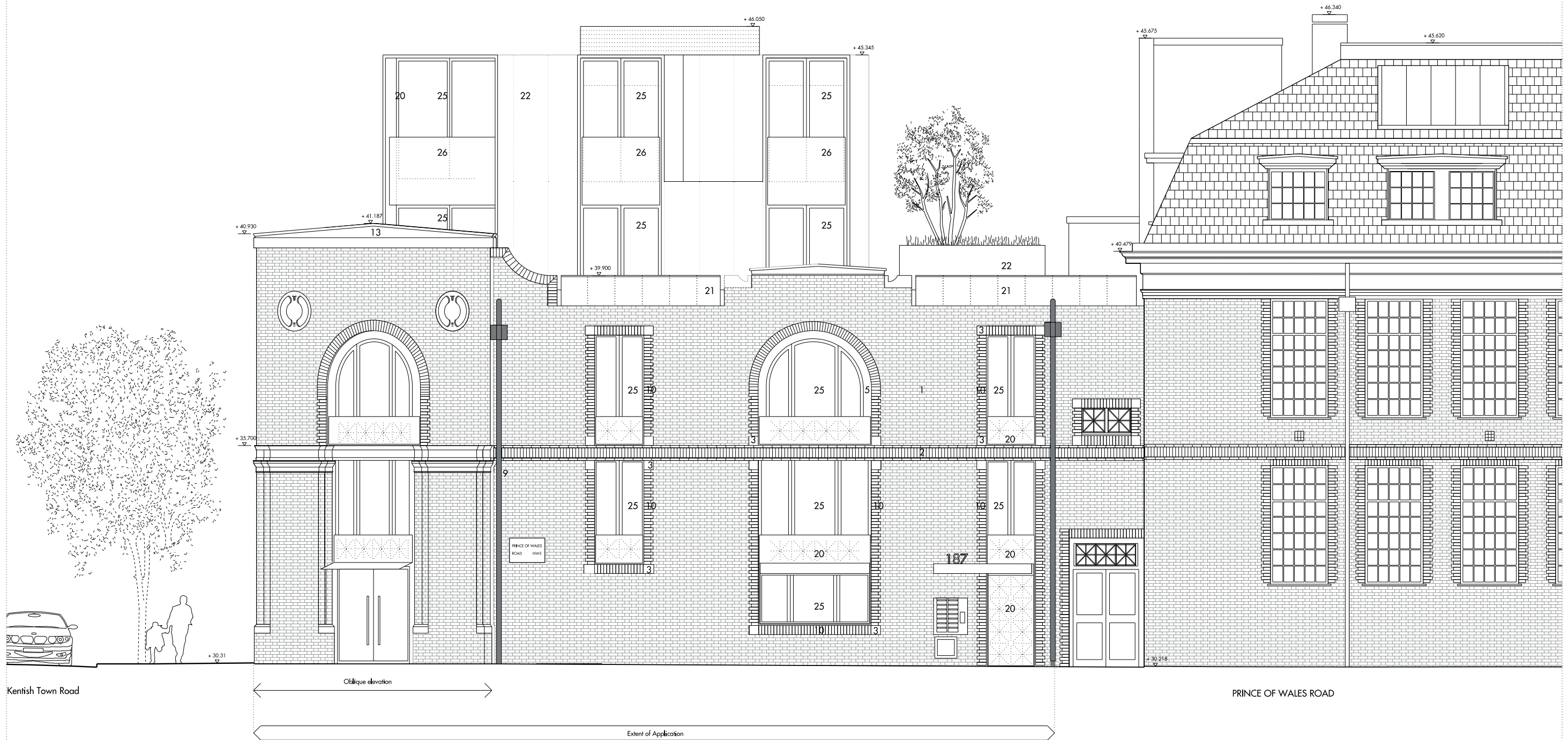
01 PROPOSED NORTH ELEVATION SCALE 1:50 @ A1