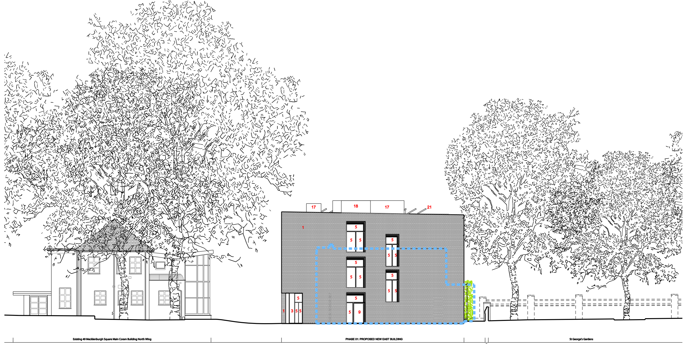
Proposed North East Elevation in Context

Gregory House: To be retained in Phase 01