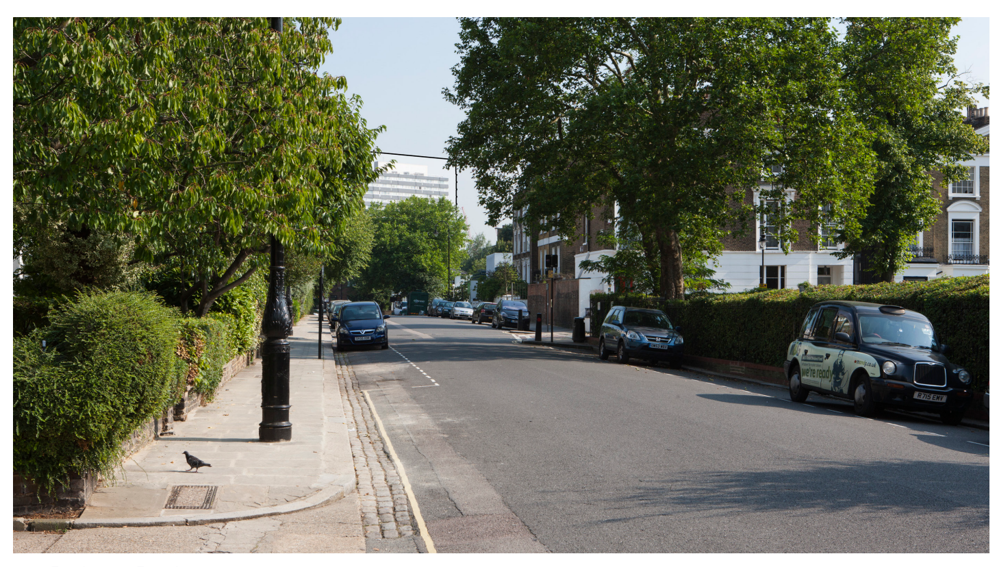
15 - Rochester Road

the Agar Grove frontage and overall high-quality appearance of the development, whilst the setting of the Conservation Area is not unduly harmed and the designated area remains a clearly legible part of the wider townscape.