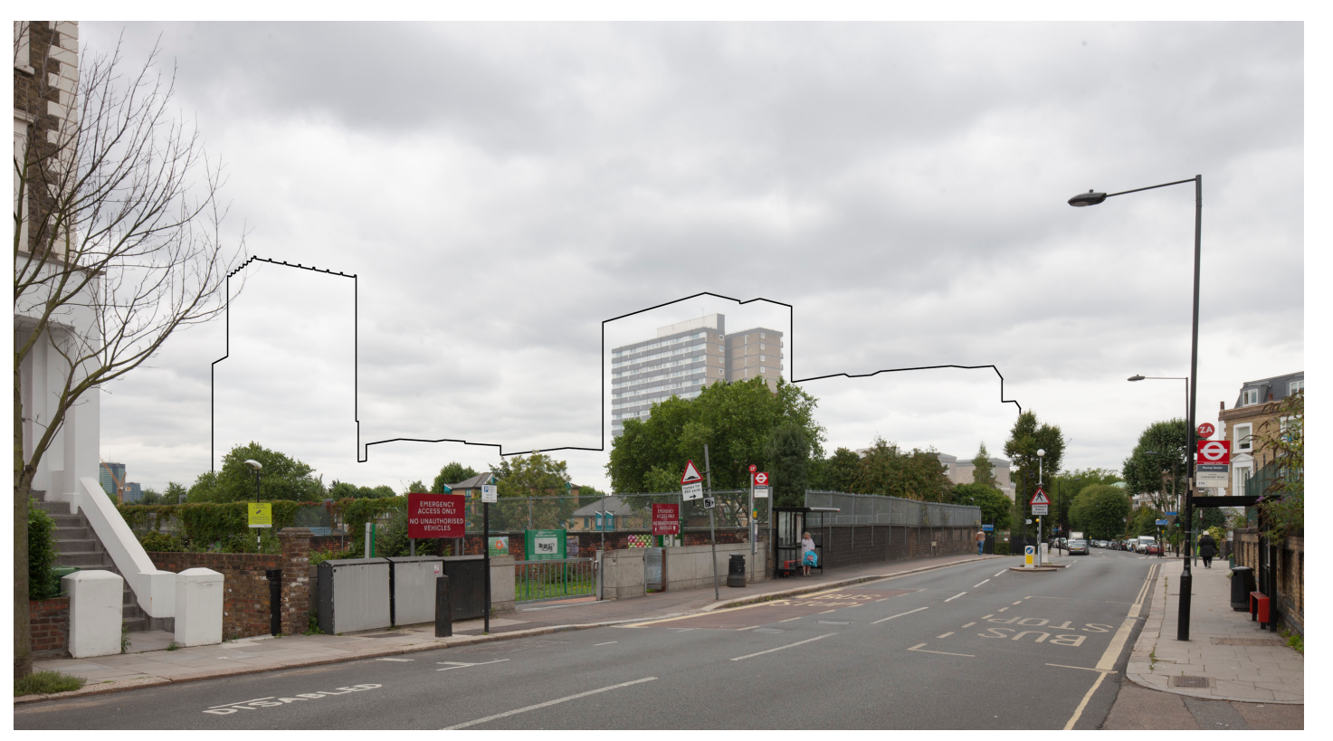
16 - Agar Grove