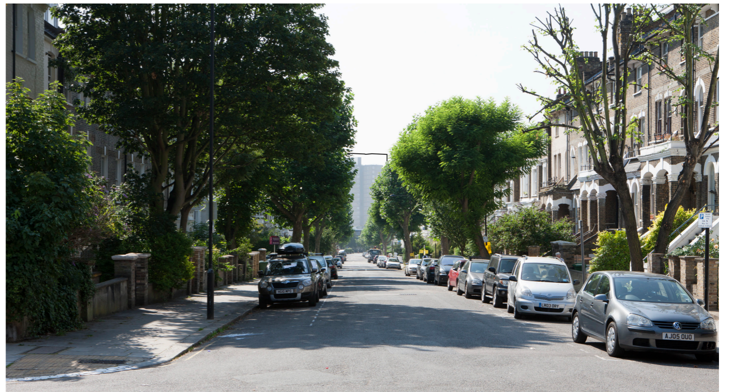
10 - St. Augustine's Road