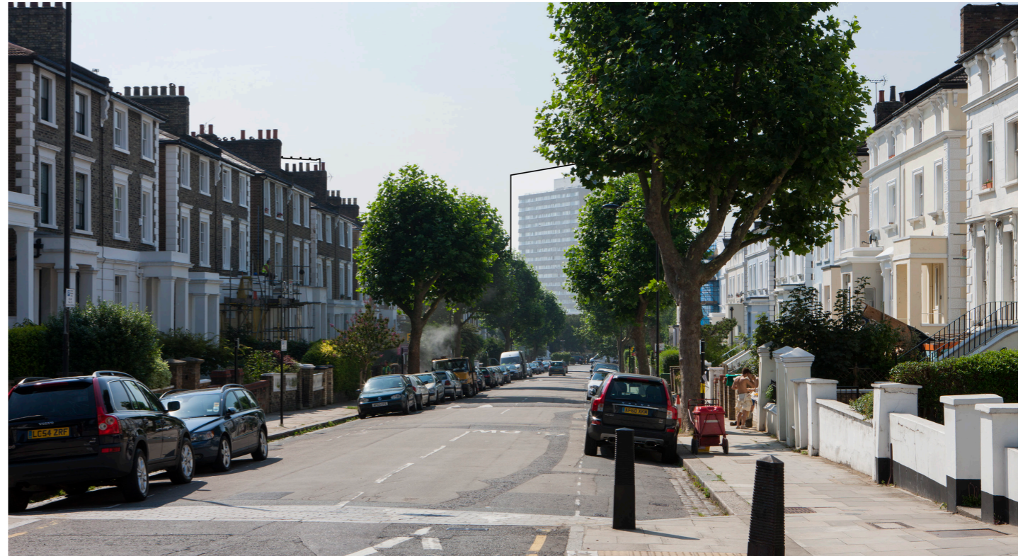
9 - St. Augustine's Road