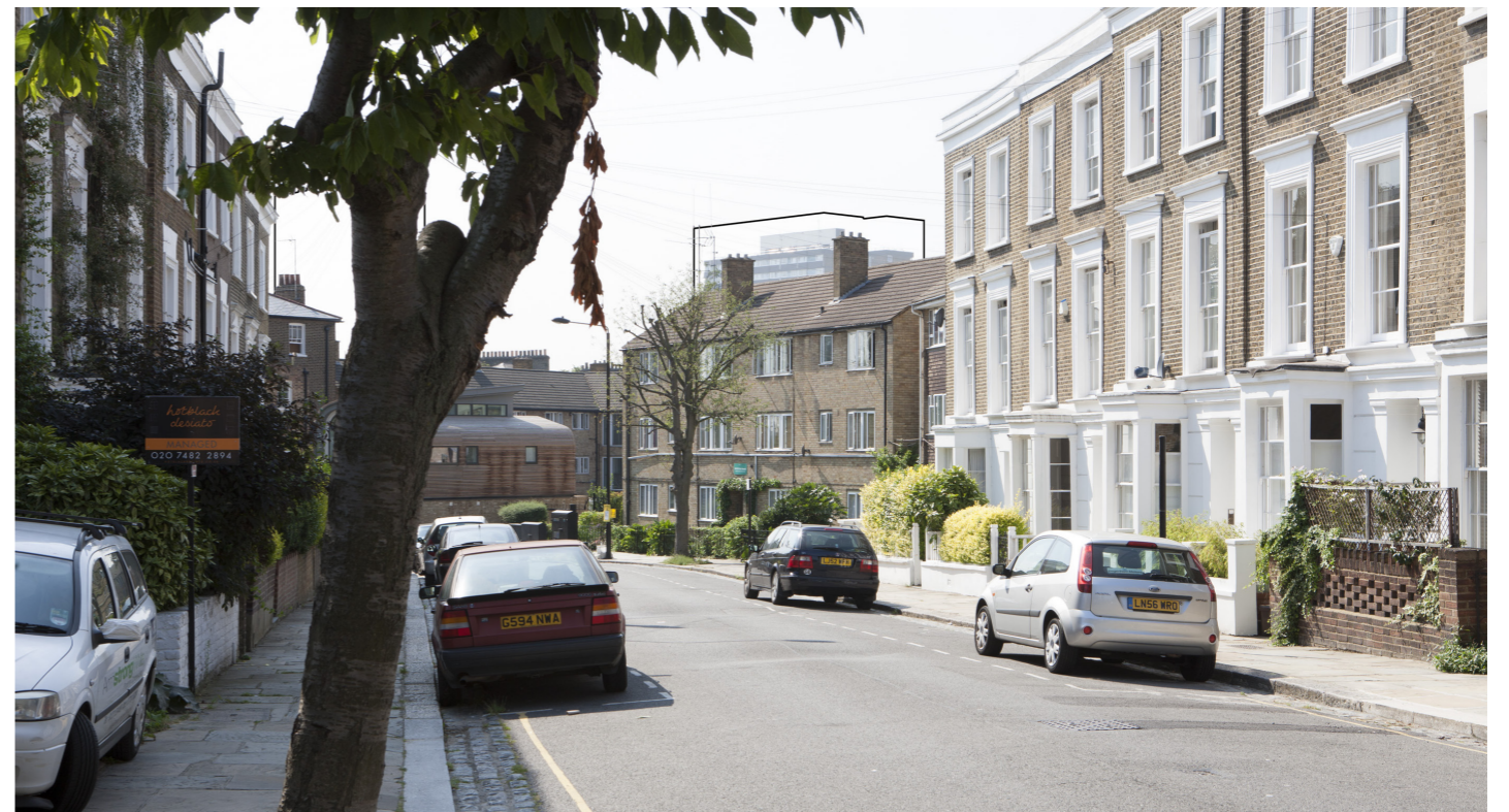
12 - St. Paul's Crescent

The existing Lulworth House is visible above the roofline of the post-war flatted development which sits at the corner of St Paul's Crescent and St Paul's Mews. The proposed extensions to Lulworth House will increase the overall massing of the building; however, the increased visual impact is marginal and mitigated by the significant improvement to the appearance of the building.