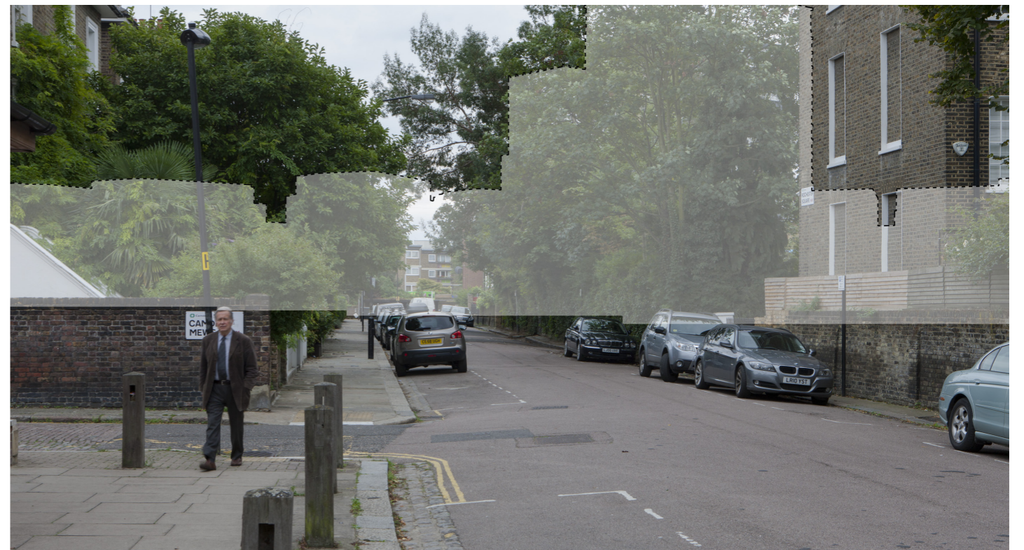
14 - Rochester Square

The application proposals will extend above the existing block of flats; however, views of the development will be limited and clearly discernible as falling in the background of the Conservation Area such that the visual impact will be marginal when considering the proposals in the round.