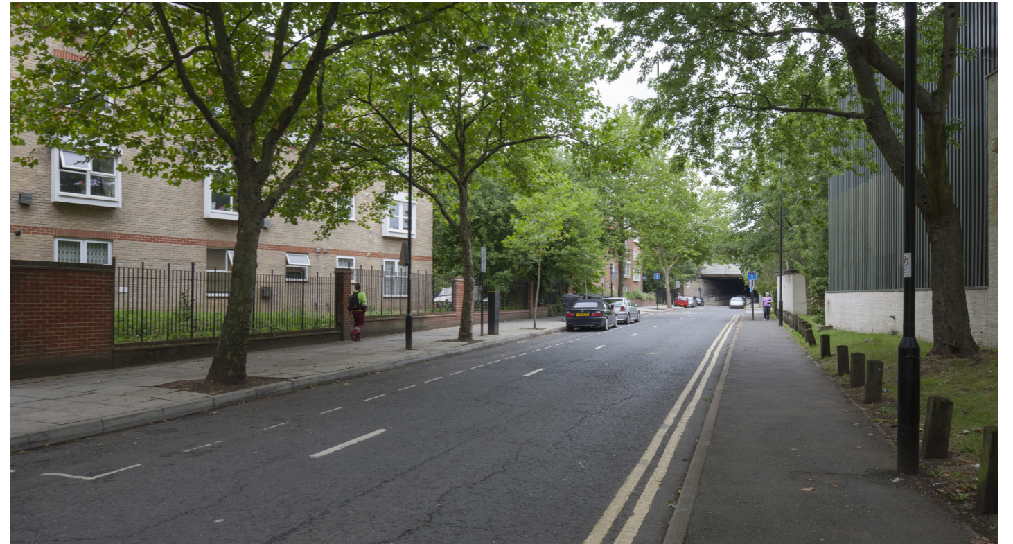
11 - Camley Street

The proposed 18 storey Block B located at the south-east corner of the site will be prominent in this view. However, the block will only be visible from a relatively limited number of locations and the general character of the Elm Village Estate will be retained by virtue of the railway line which marks a clear break in the townscape