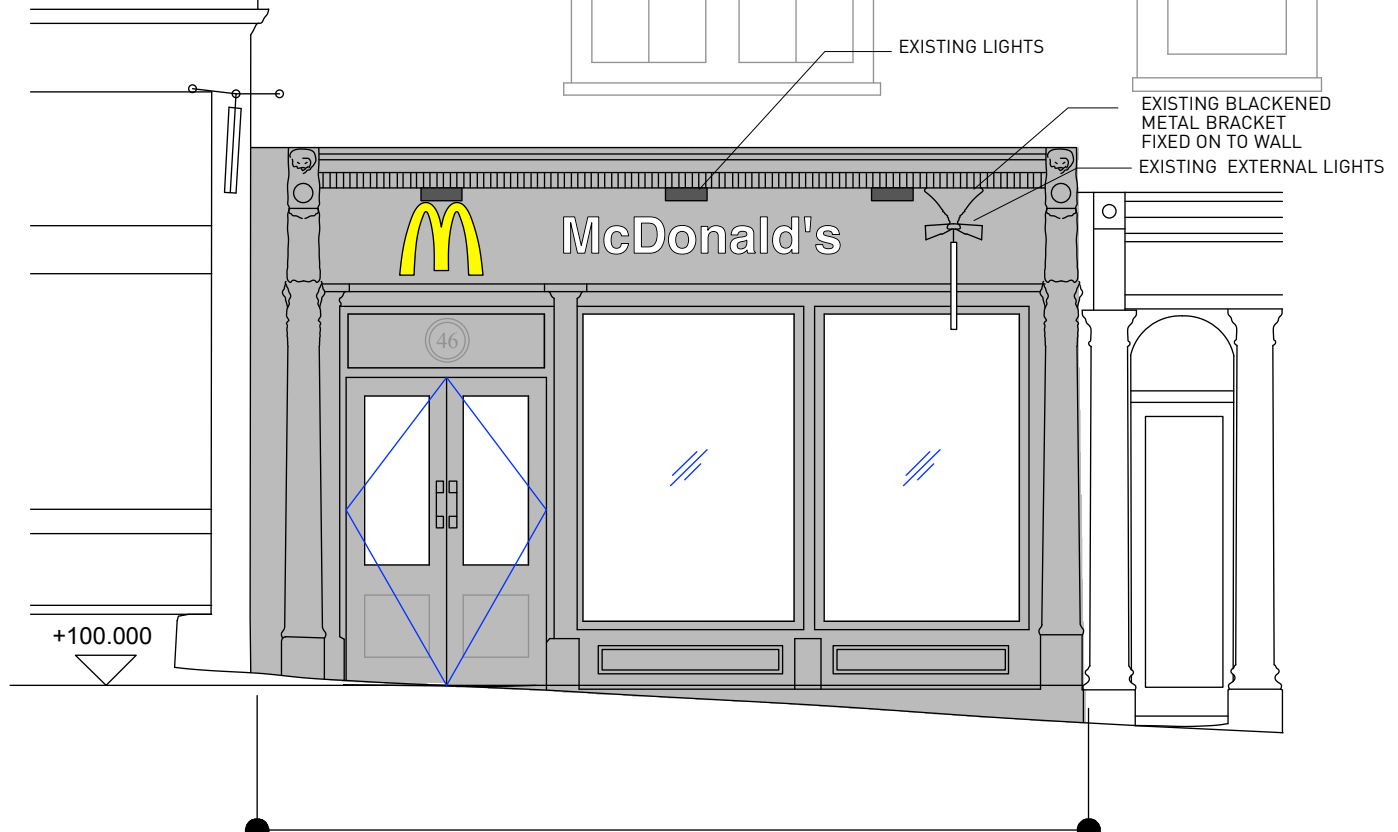
EXISTING SHOPFRONT (1:50 @ A3)

GENERAL NOTES: Do not scale from this drawing. Check drawing on receipt and immediately report any discrepancies to the Architect. Verify all dimensions and levels on site prior to construction. The contents of this drawing are Stiff + Trevillion Architects LLP copyright and shall not be re-used without their written permission.