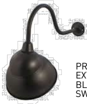
PROPOSED EXTERNAL LIGHTS: BLACK POWDERCOATED SWAN NECK LIGHT

MENU HOLDERS CEILING TO FLOOR CABLES, WITH SINGLE SUPPORTS FOR PANELS. COLOUR: BLACK FINISH MENU PANELS: ACRYLIC, NON GLARE SIZE: A4 PORTRAIT