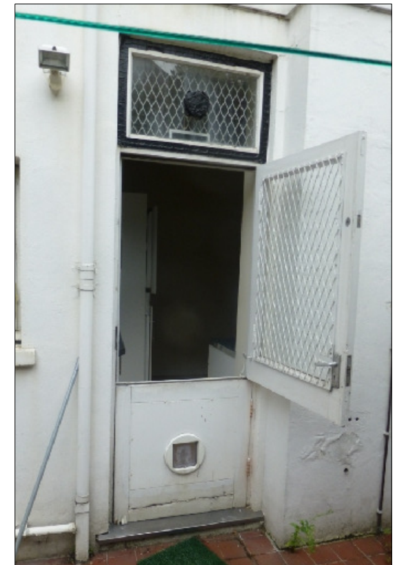
PHOTOGRAPH 2 Rotten door to be replaced