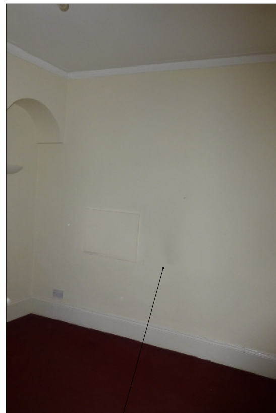
PHOTOGRAPH 3 Wall in which new opening will be located