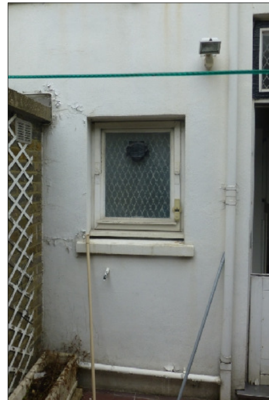
PHOTOGRAPH 1 Rotten window to be replaced