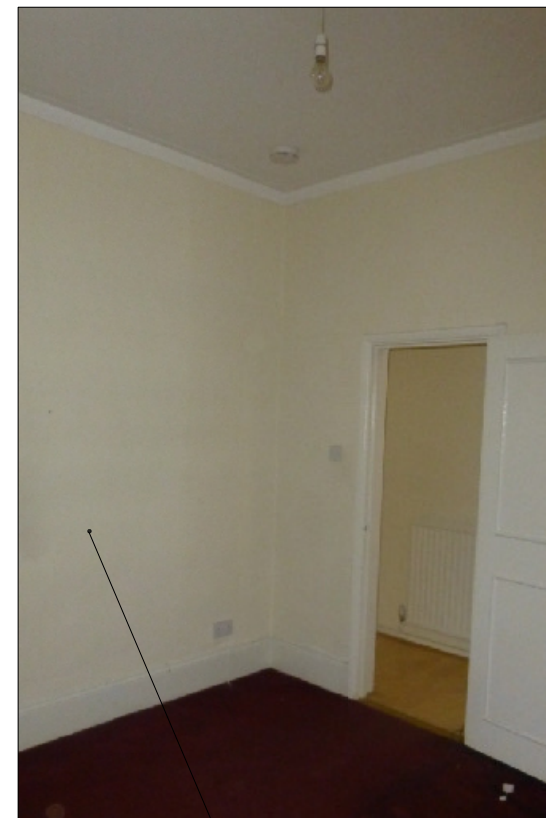
PHOTOGRAPH 4 Rotten door to be replaced