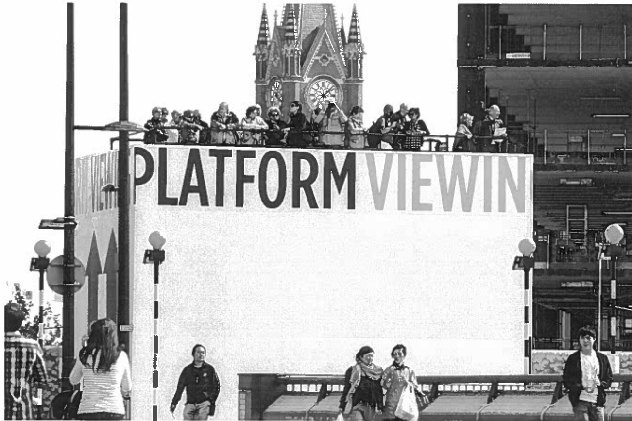
Figure 6: Viewing Platform in use at its present site

This Design & Access Statement explains the design principles and concepts which underpin the design of the proposed temporary Viewing Platform.