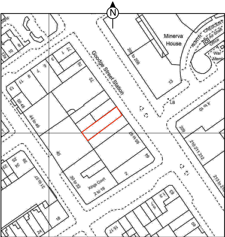
8 LOCATION PLAN 1:1250

ATTWOOD DESIGN 53 TENTERCROFT AVENUE SYSTON LEICESTERSHIRE LE7 2EZ TEL 0116 319 0796 MOBILE 07951 270749 clive.attwood2@btinternet.com