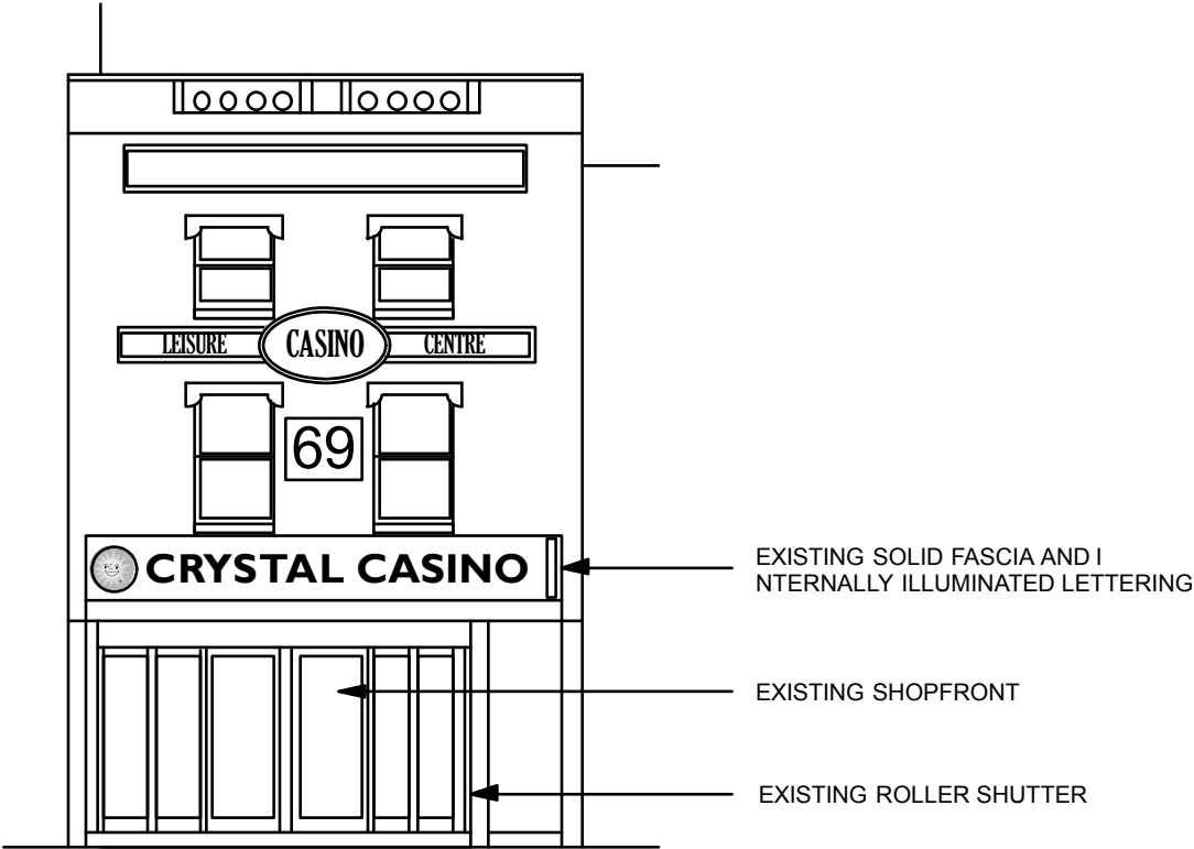
7 EXISTING ELEVATION