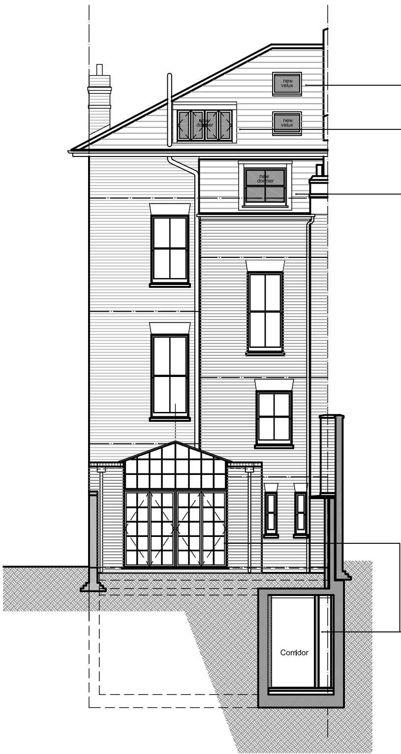
Rear Elevation/ Section G-G