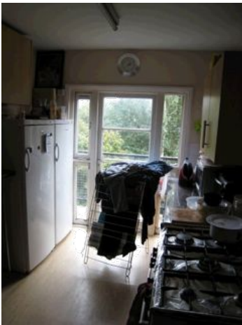
french windows to balcony