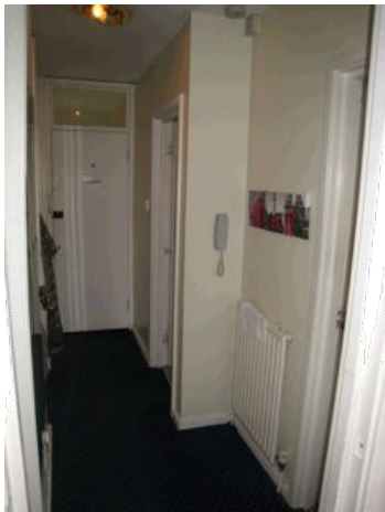
hallway - view towards the entrance door