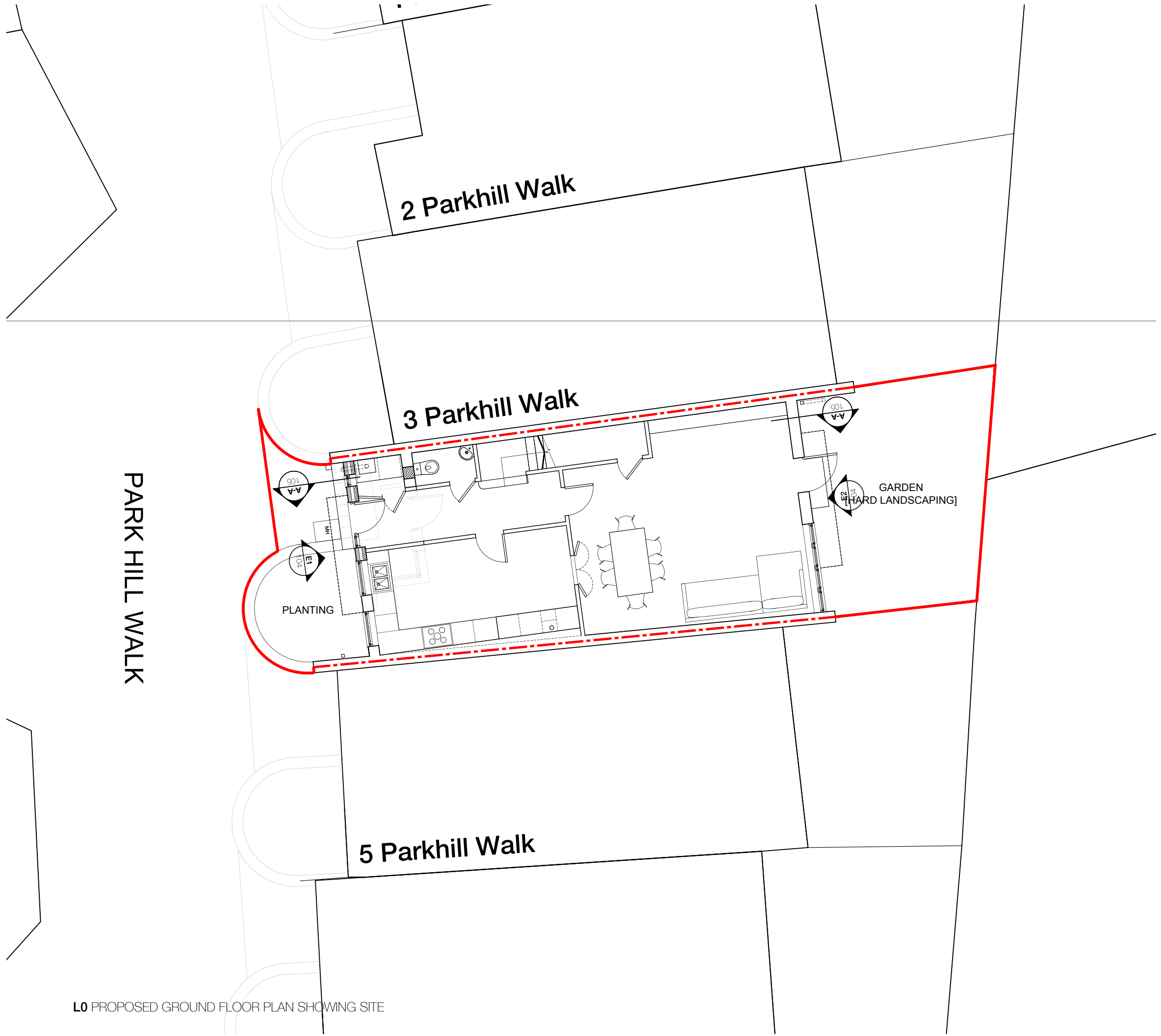
L0 PROPOSED GROUND FLOOR PLAN SHOWING SITE