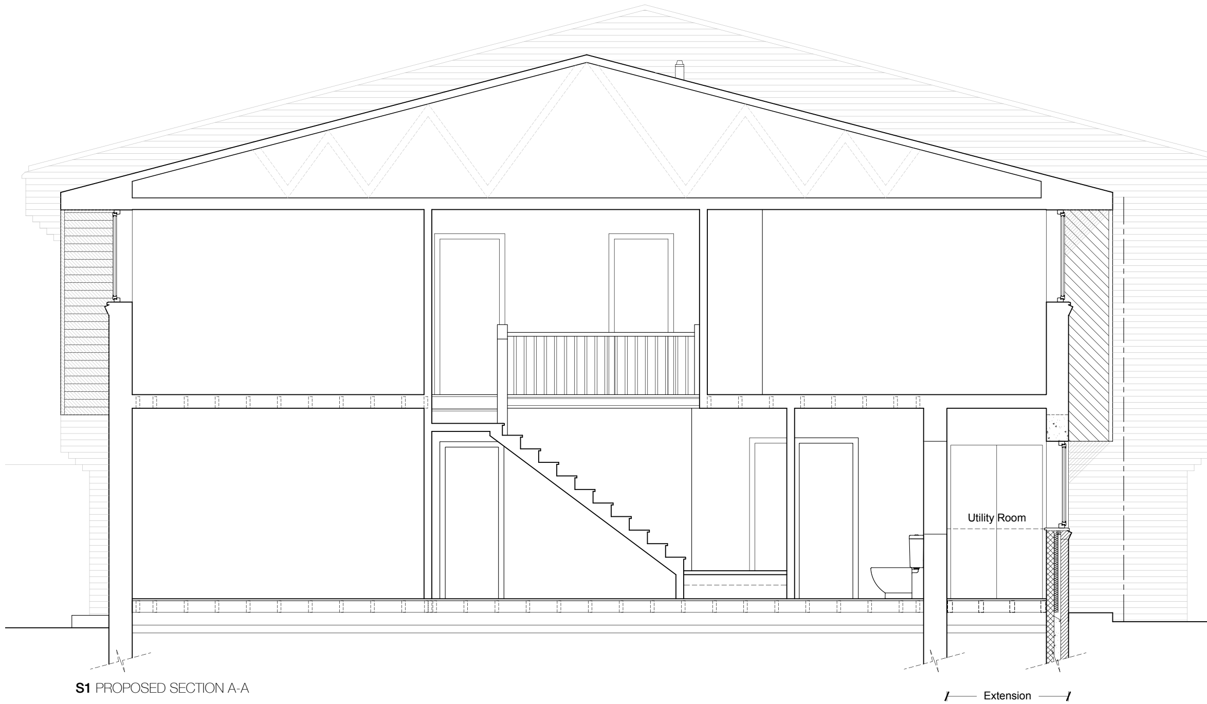
S1 PROPOSED SECTION A-A