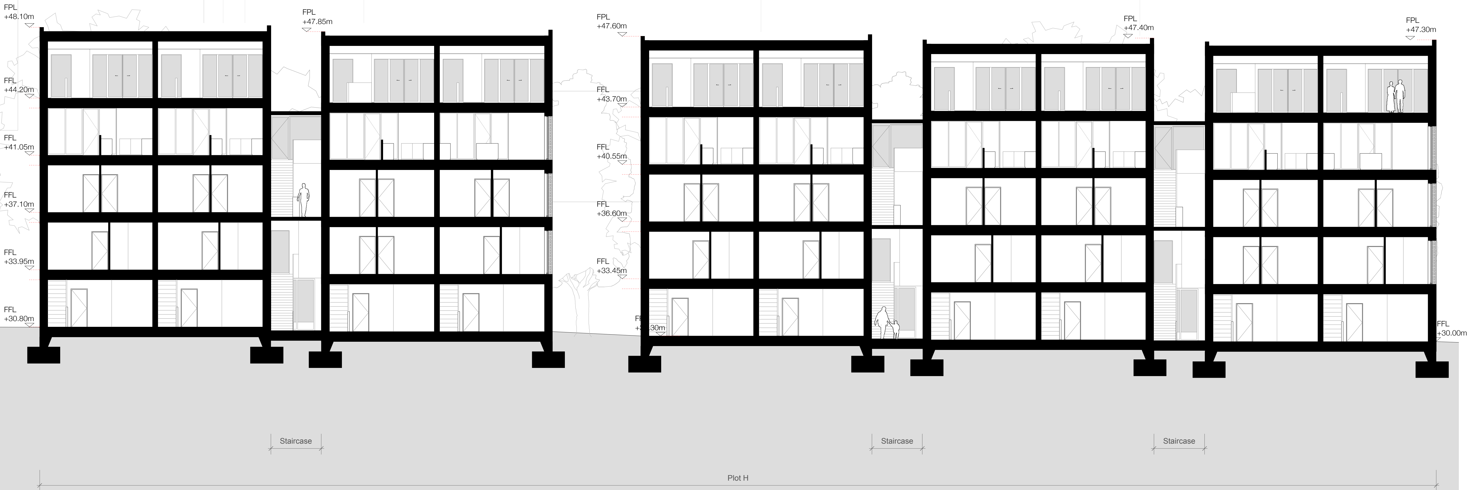
01 Section A

NOTES: 1. Measurements are based on metric system. 2. All levels are in meters to Principal Datum (PD) unless noted otherwise. 3. Do not scale drawing. 4. Figure dimensions are to be followed. 5. Do not use for construction unless expressly permitted. 6. Contractor should verify all conditions on site and notify contract administrator of any variations from dimensions before construction. 7. Internal furniture is indicative only.