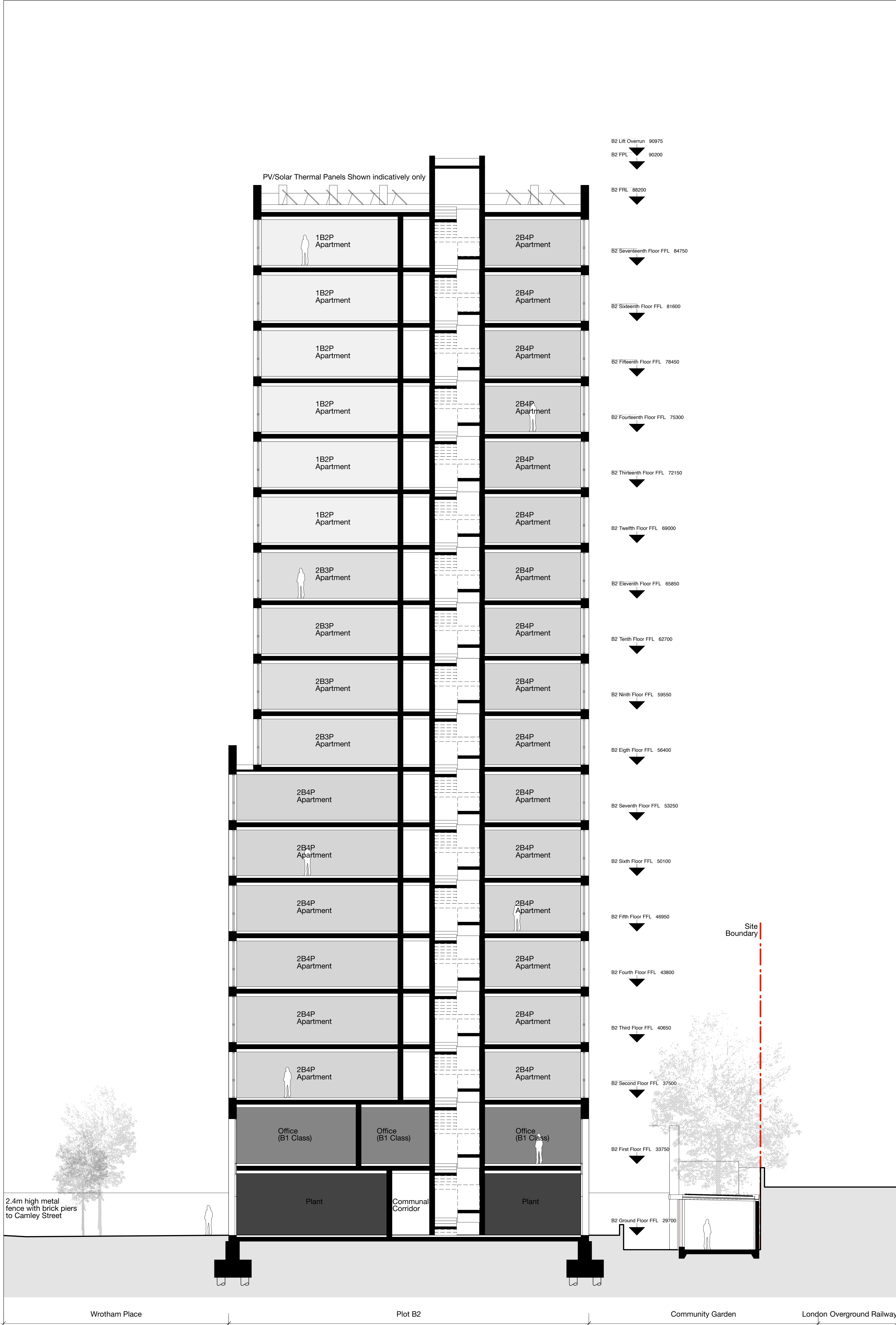
01 Section C Scale 1:100 @ A0