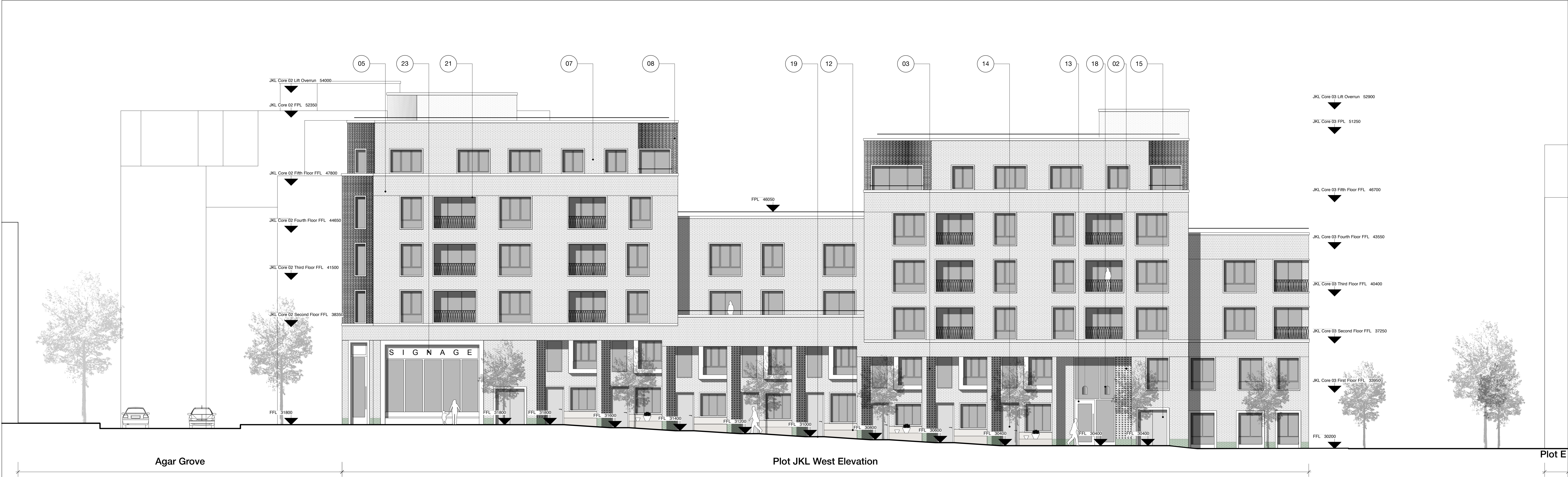
01 West Elevation Scale 1:100 @ A0