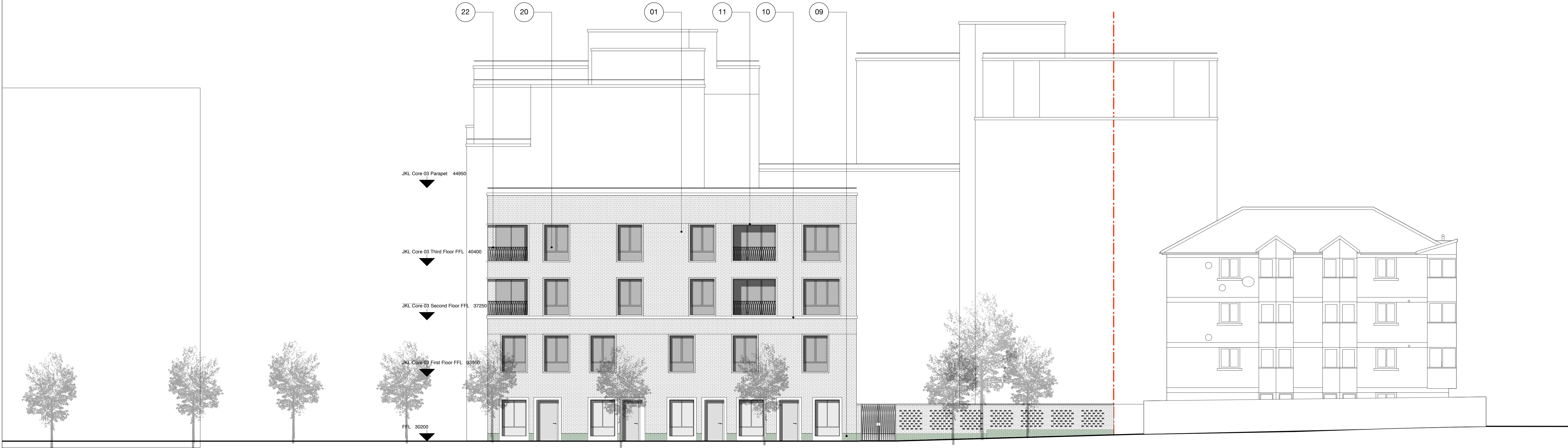
02 South Elevation Scale 1:100 @ A0