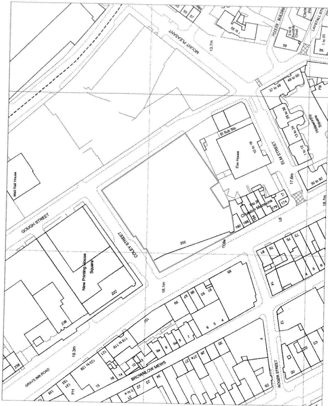
Ordnance Survey / Scale: 1:1250