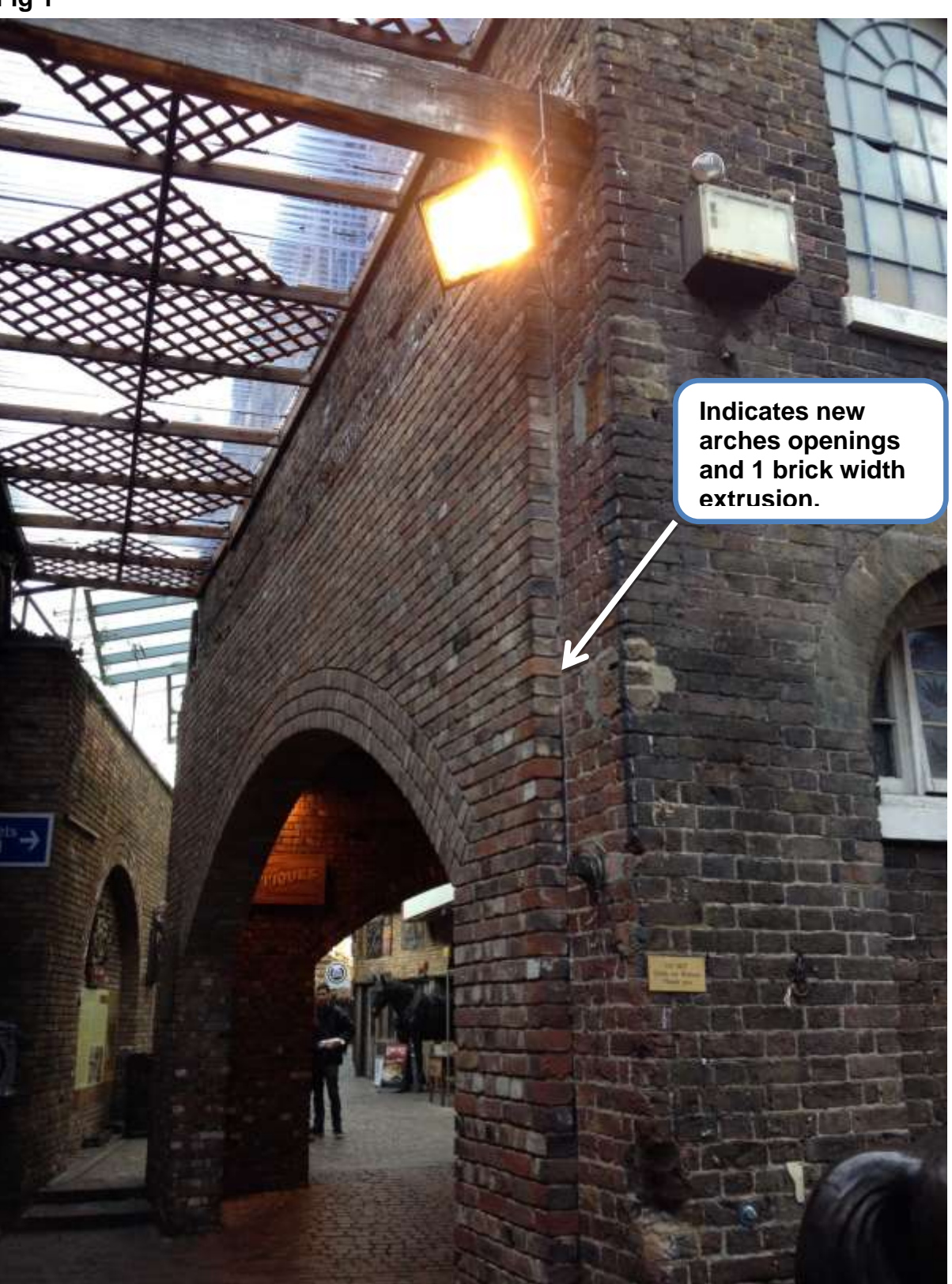
Structural Appraisal of Tack Room Ref: P:\Projects\3788\Documents\Reports\3788-pm-rpt-0115ksa.doc