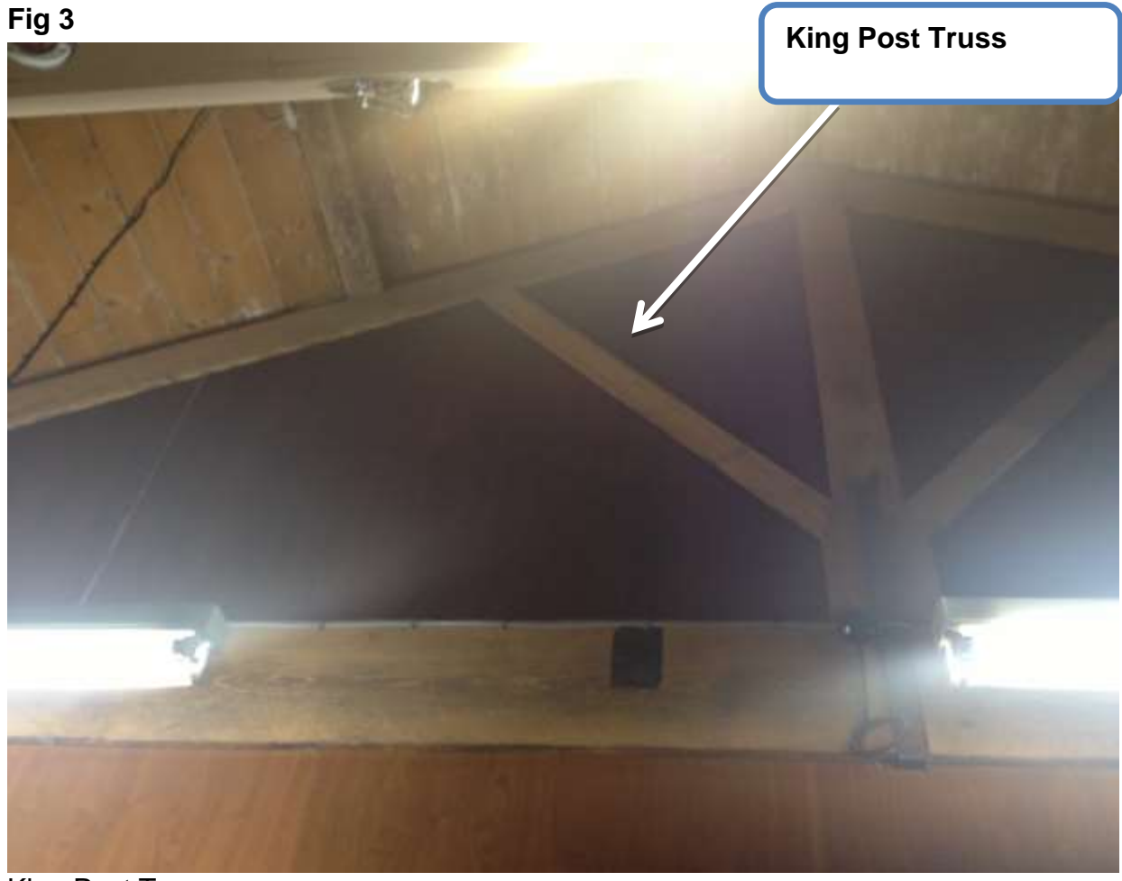
King Post Truss