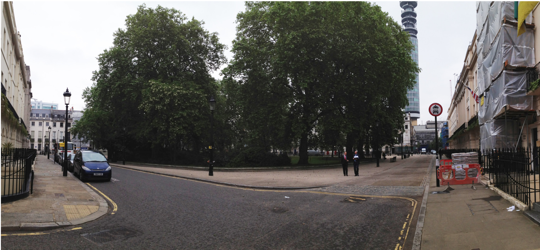
3. Fitzroy Square panoramic view