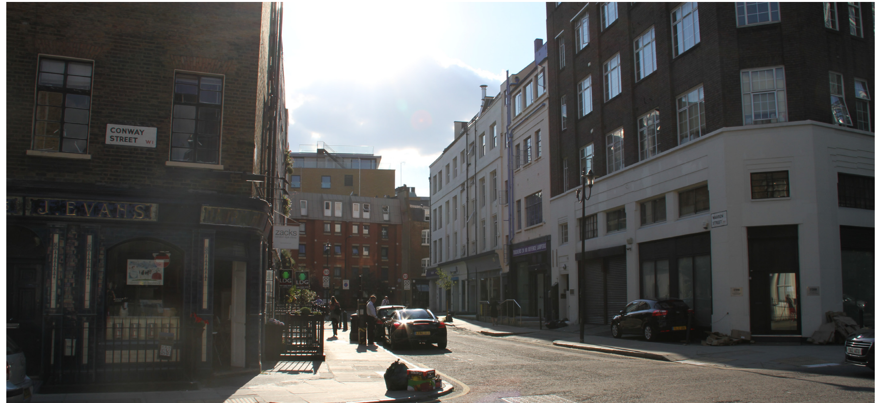
6. Existing view of the site from Warren Street, looking west