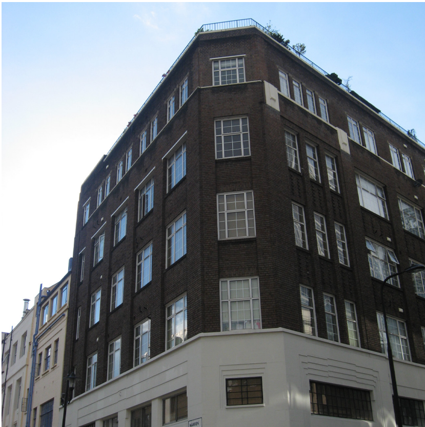
1. No.41-42 Warren Street (corner of Euston Road and Conway Street)

Warren Street was originally built as a residential street but since then retail units have been inserted on most of the ground floors with business occupying a significant proportion of the upper floors. Along the south of the street, numbers 30 to 34 retain their original stock brick facades with contemporary retail shop fronts at ground floor. The block containing the application site is all modern however as the terrace runs to the east the old houses are retained.