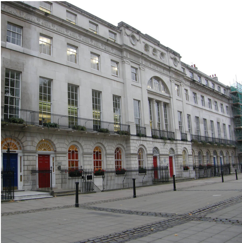
2. Facade surrounding Fitzroy Square