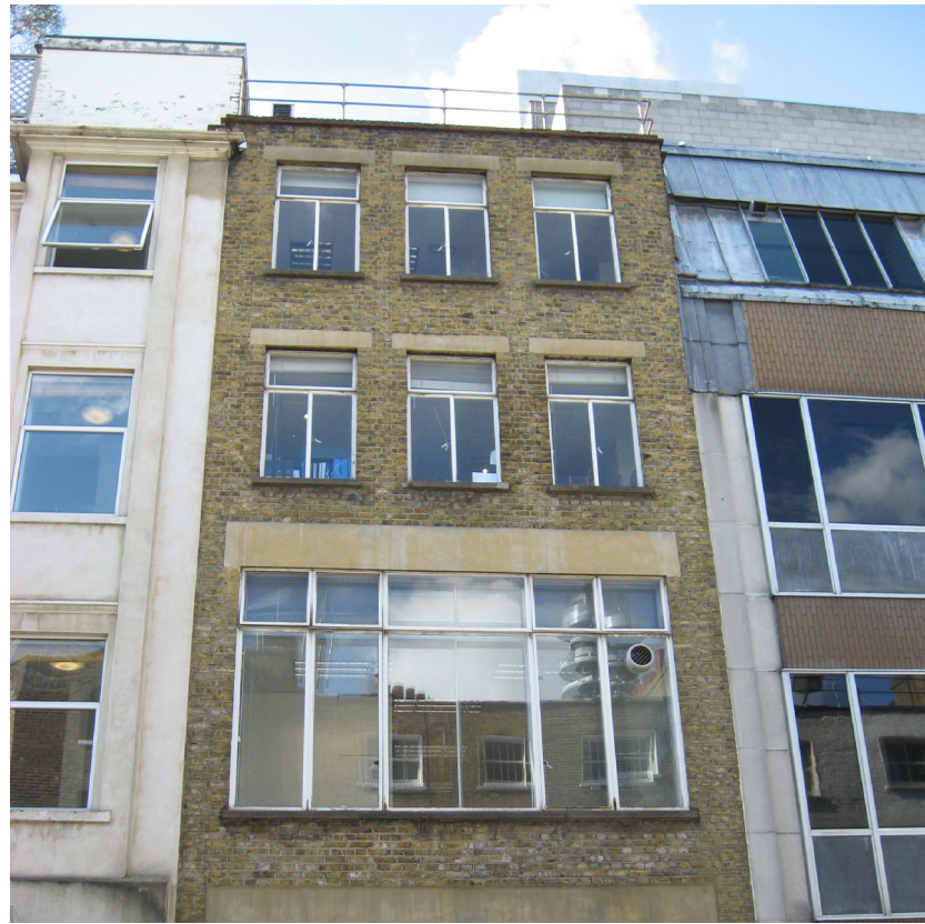
5. Commercial properties along Warren Street