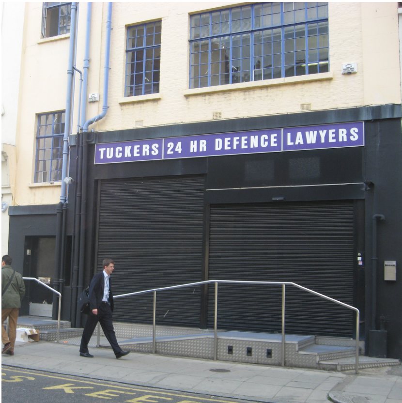
4. Commercial unit at ground floor at no.39-40 Warren Street