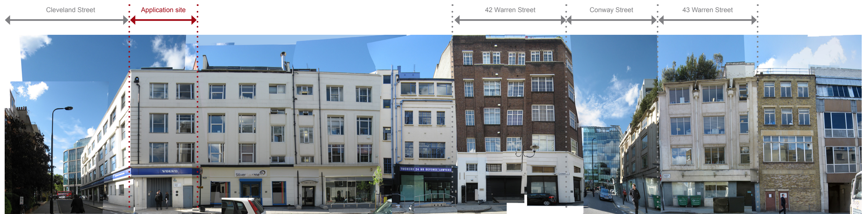
Warren Street elevation