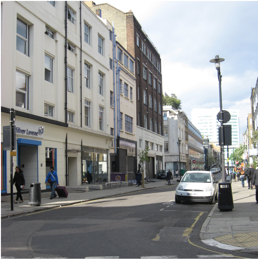
3. View looking east along Warren Street