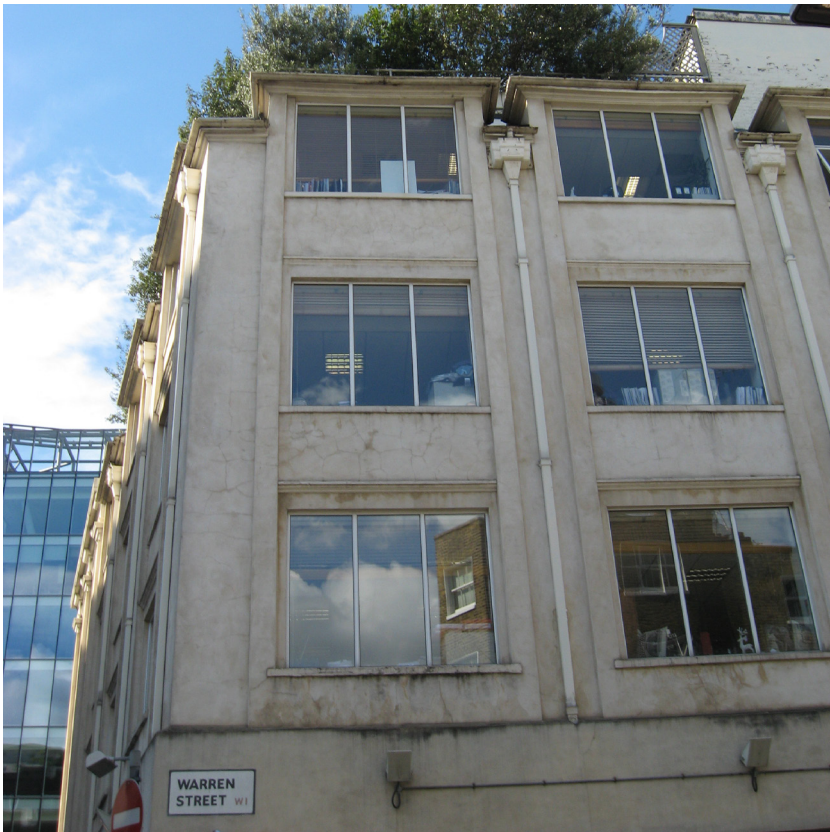
2. No.43 Warren Street