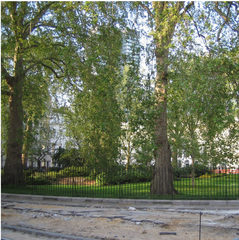
1. Fitzroy Square

The Square is the heart of the Fitzroy Square Conservation Area immediately adjacent to the application site, and, as such needs to be considered as views in and out of the Conservation Area must be sensitively handled.