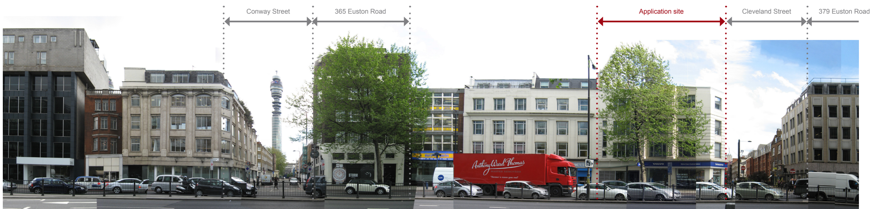
Euston Road street elevation