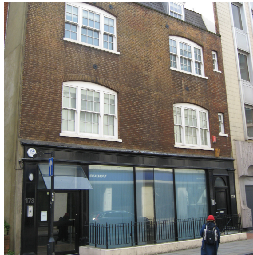
3. No. 173-175 Cleveland Street, residential at upper floors