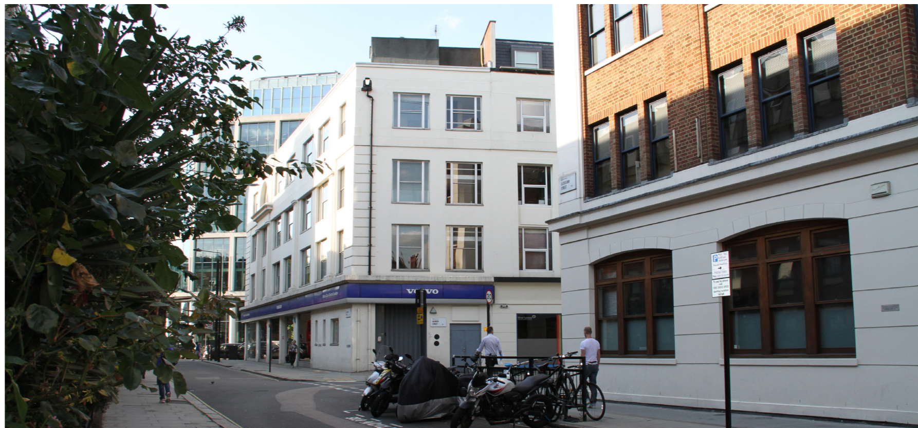
6. Existing view of the site from Cleveland Street, looking north