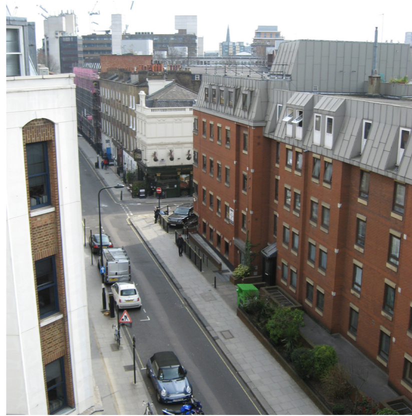
1. Howard House, opposite the site at 161-171 Cleveland Street

There are a significant number of Grade II Listed buildings along the street.