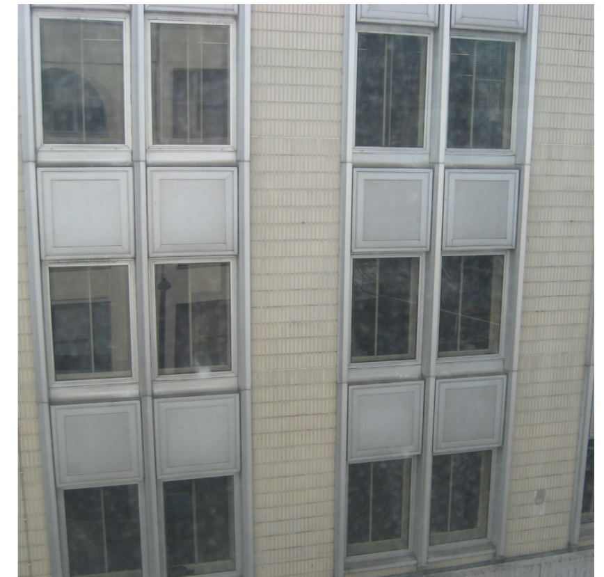
4. Commercial windows of 379 Euston Road, immediately opposite the site