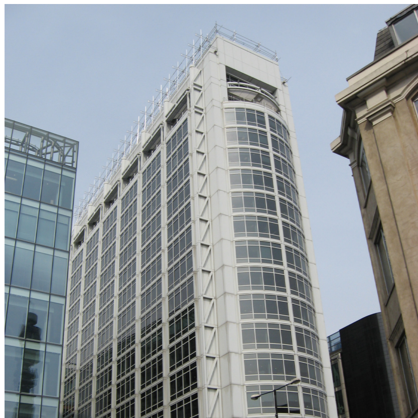
5. High rise commercial building along Euston Road