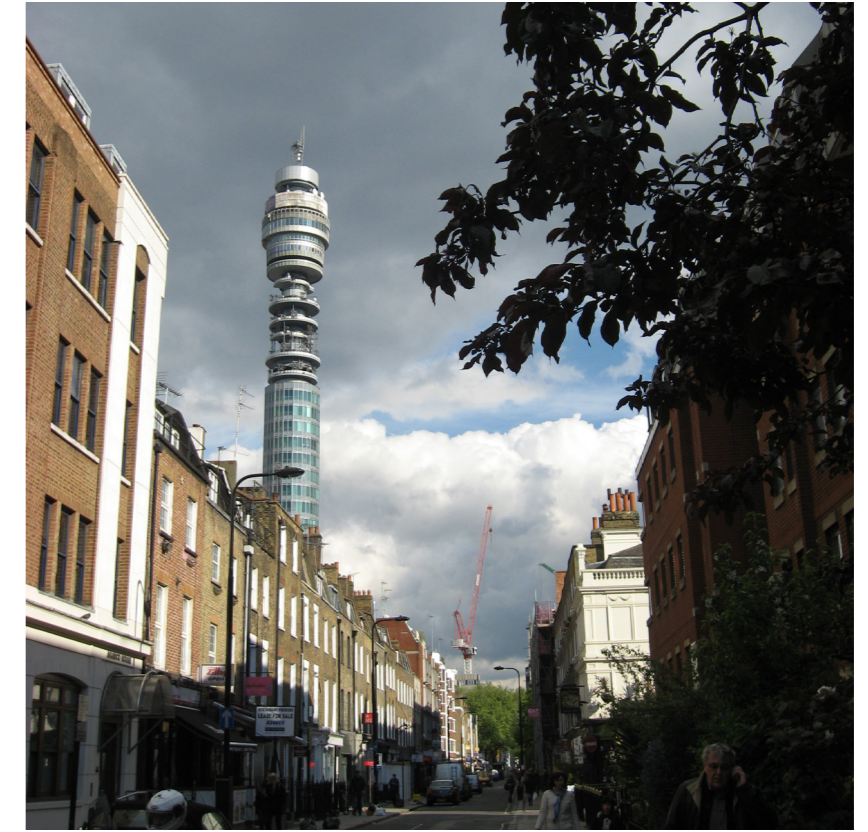
2. View looking south along Cleveland Street