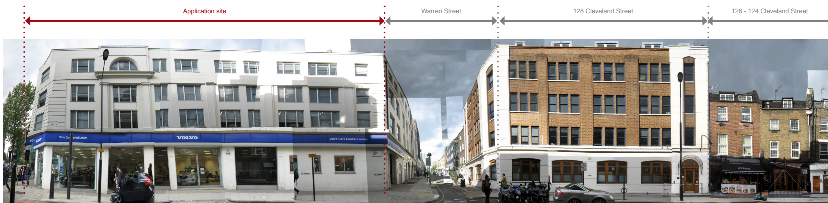
Cleveland Street elevation