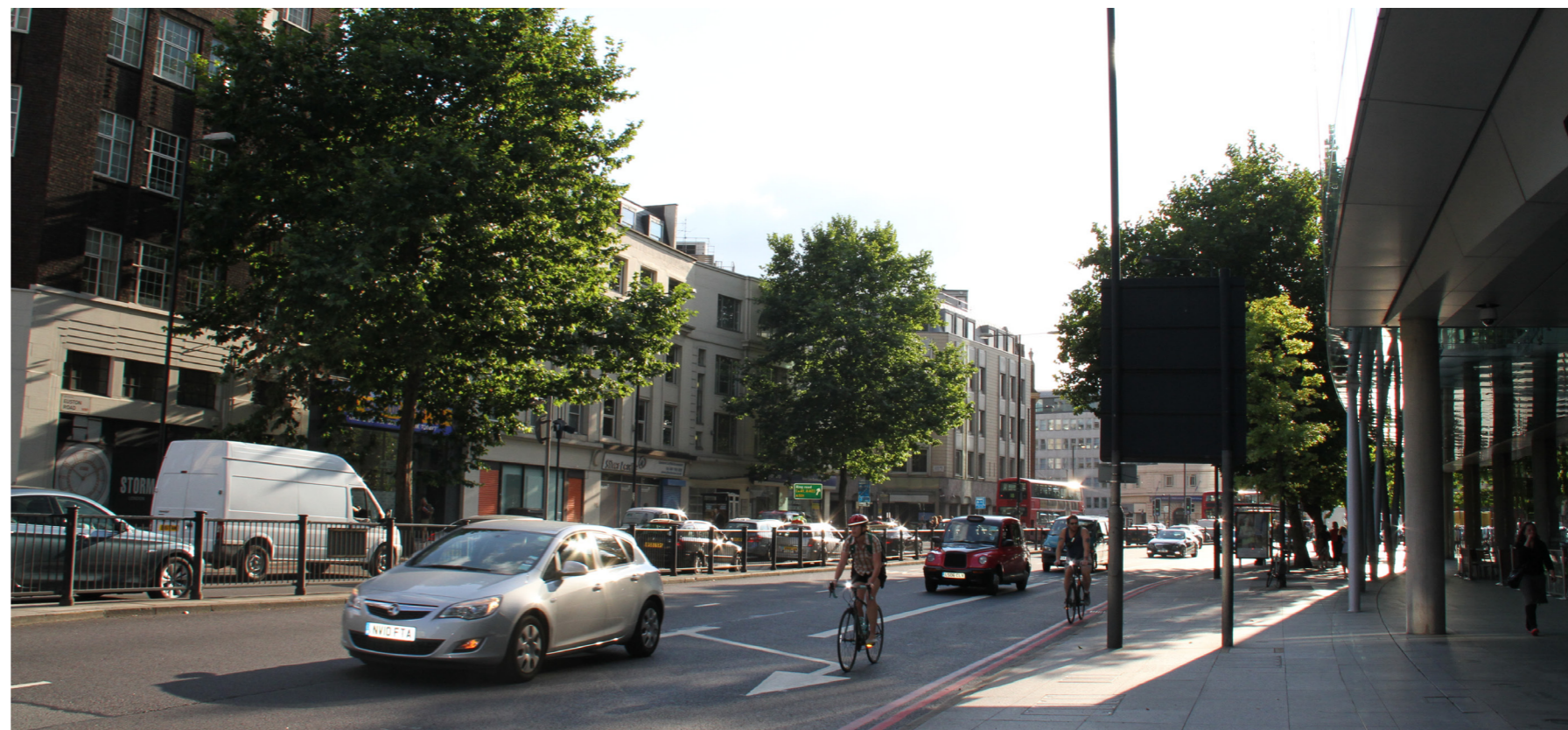
6. Existing view of the site from Euston Road, looking west