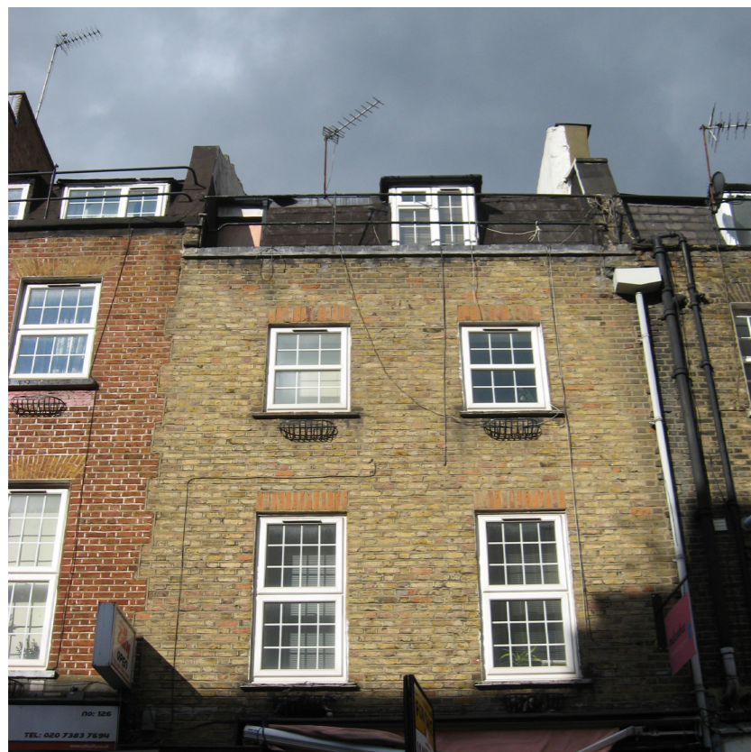
5. Low rise housing further south along Cleveland Street