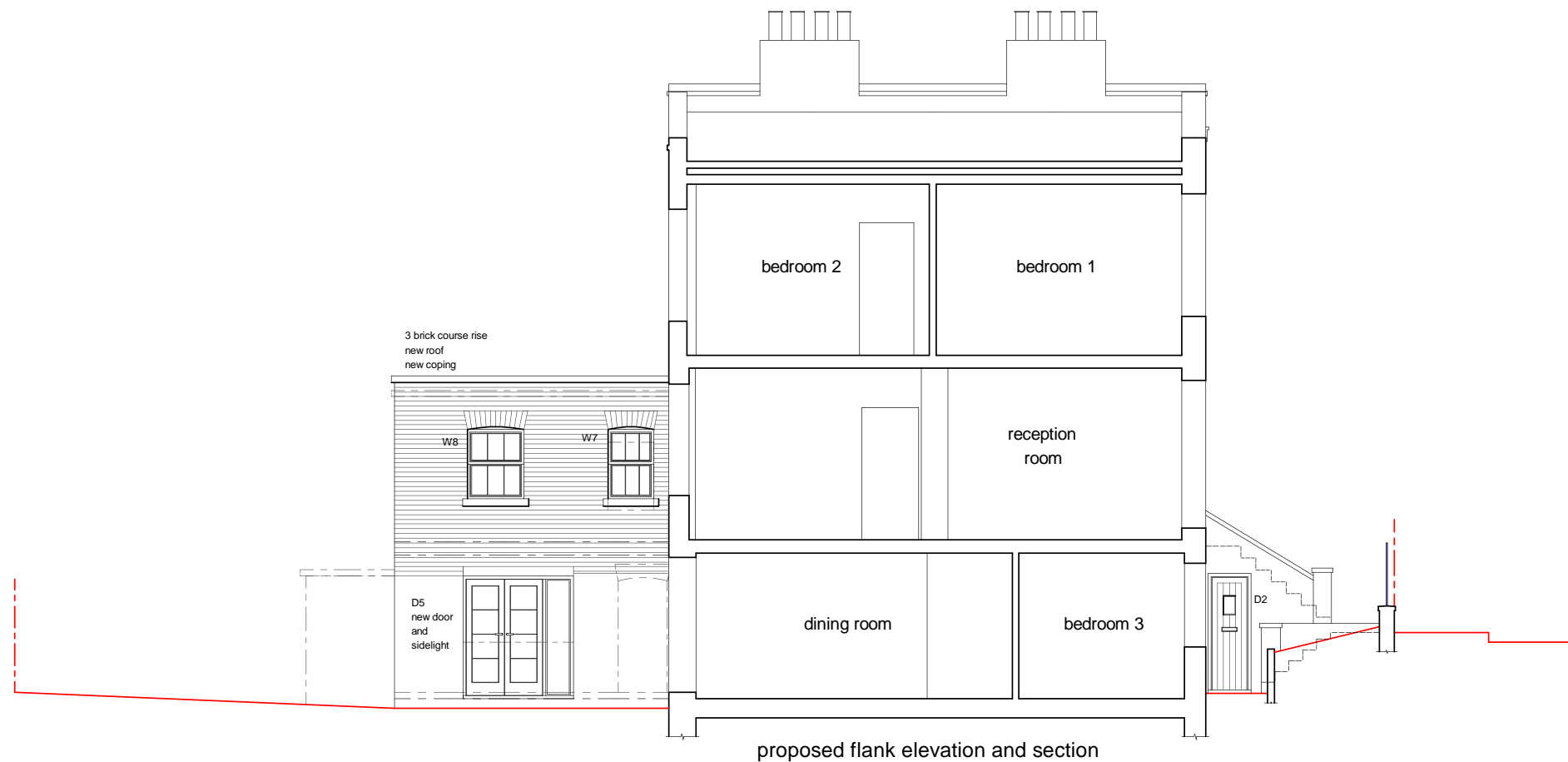
proposed flank elevation and section