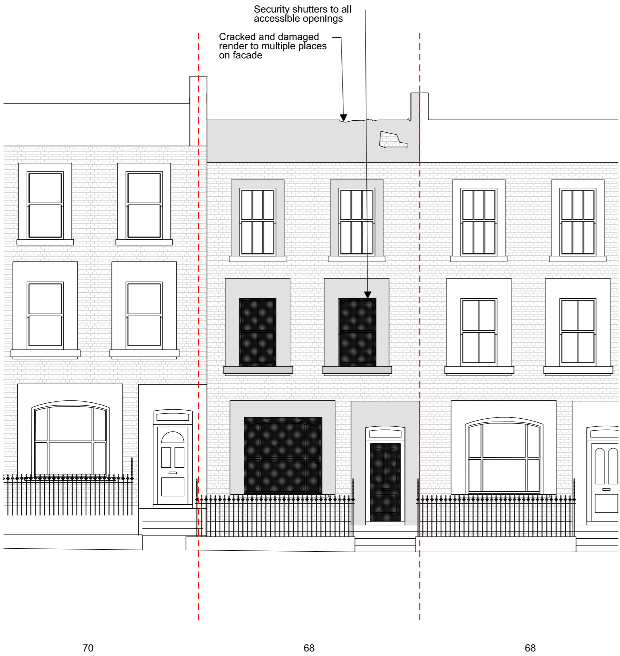
0 Front Elevation