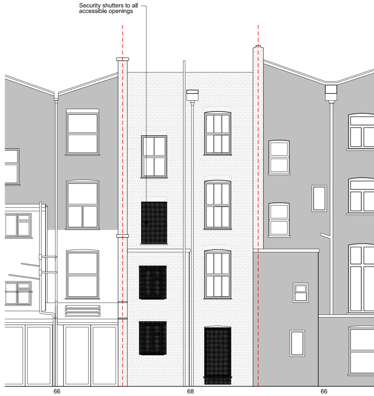
1 Rear Elevation