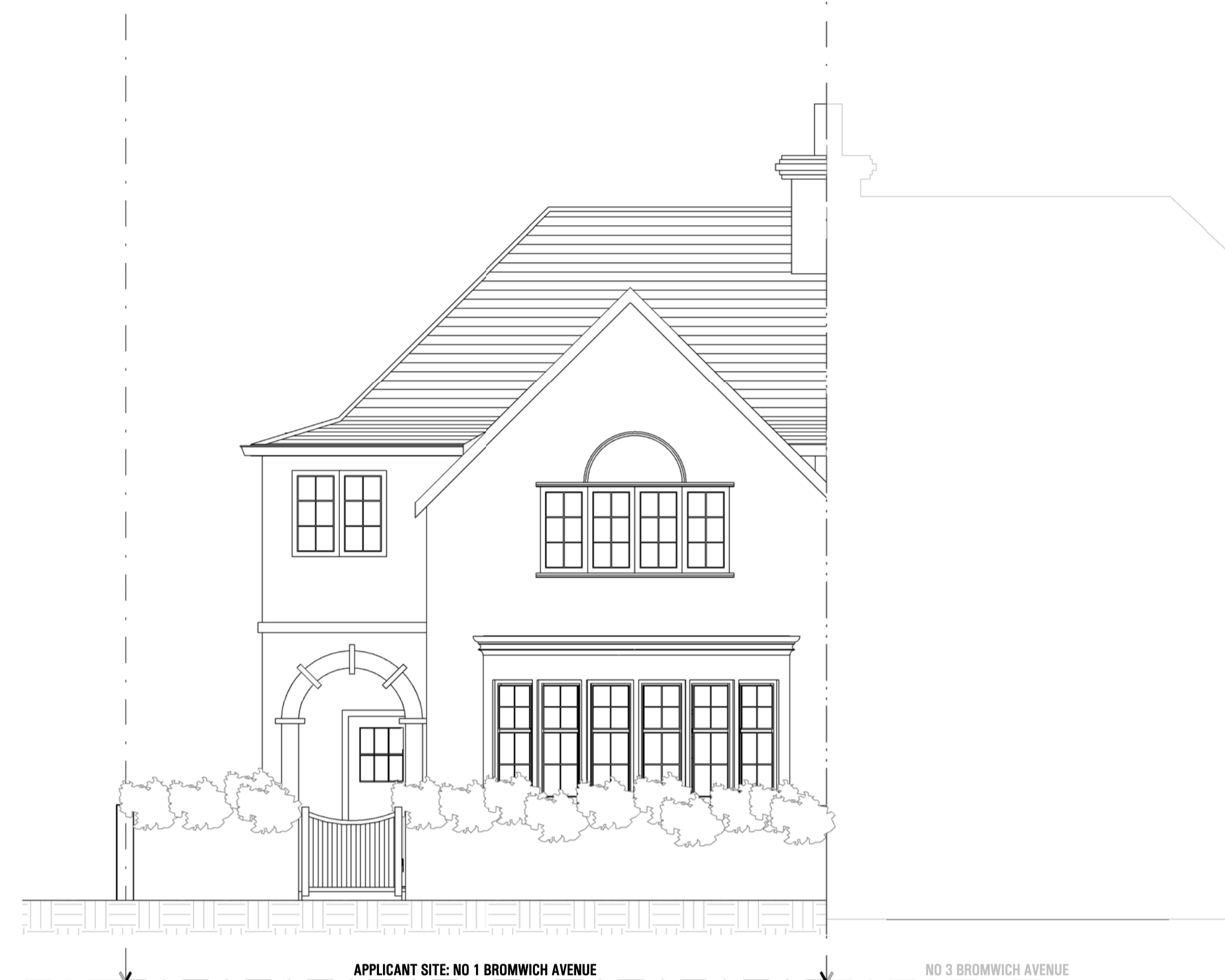
02. EXISTING STREET ELEVATION