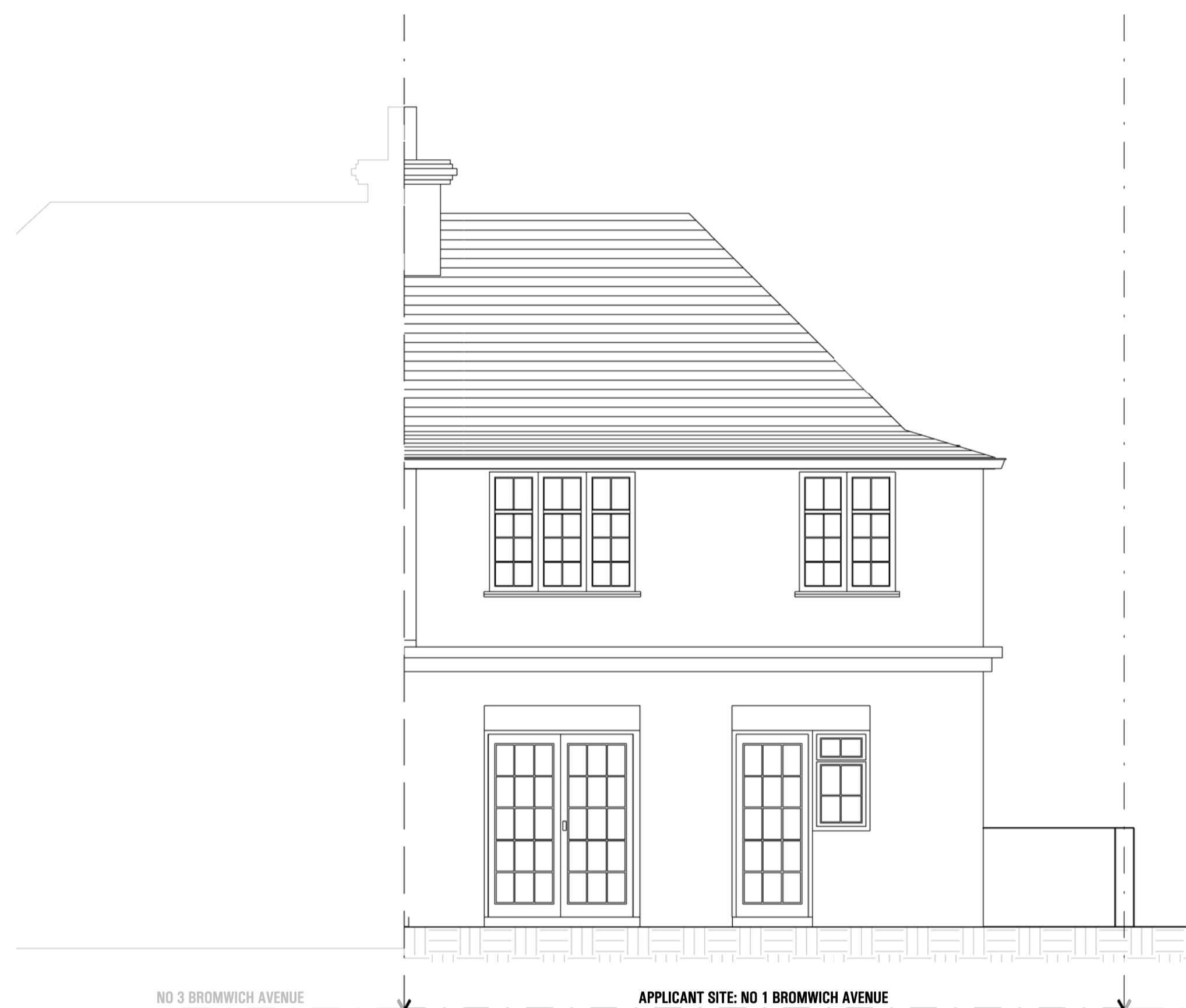
01. EXISTING REAR ELEVATION