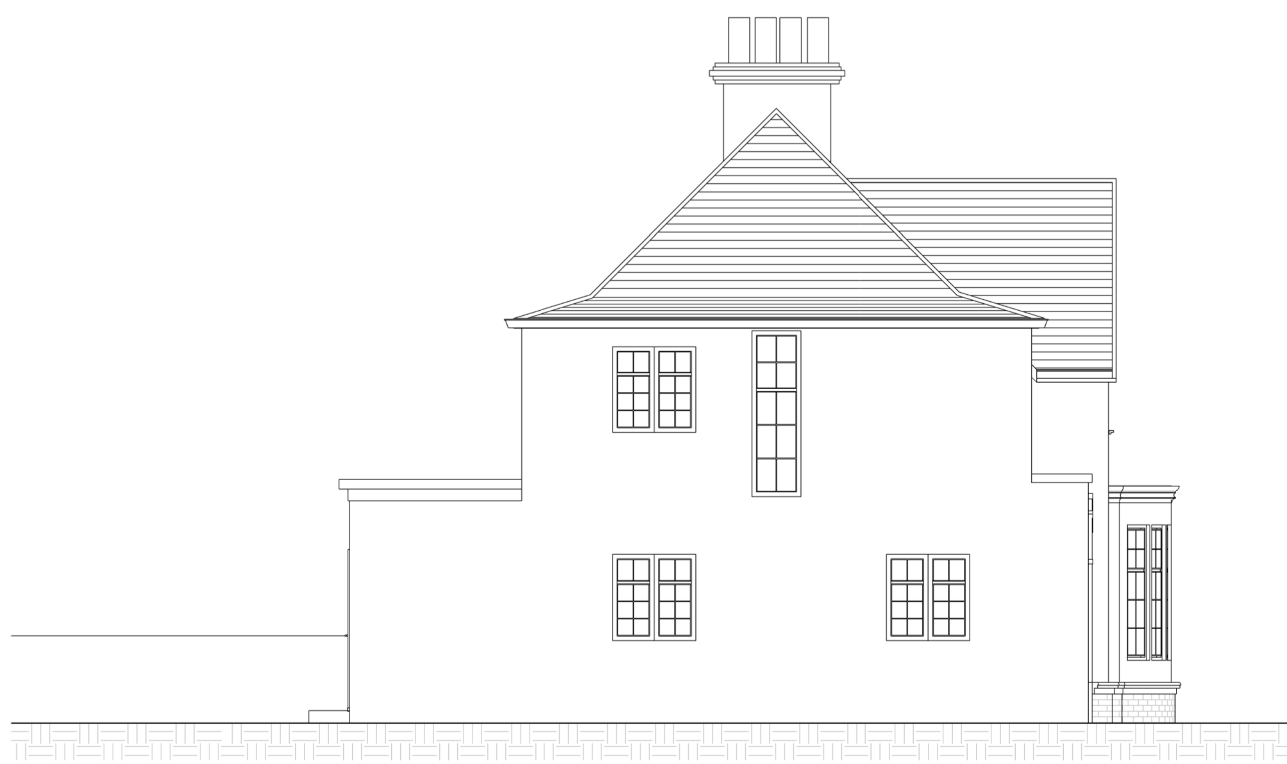
03. EXISTING SIDE ELEVATION