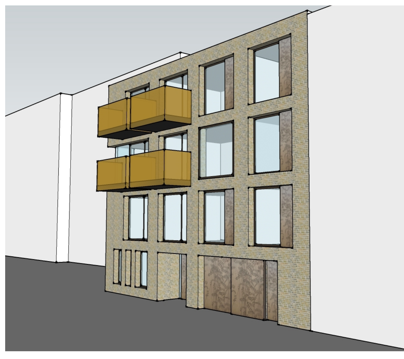
3D Sketch illustrating deep and flush window reveals (NTS)

© Lees Munday Ltd Figured dimensions only are to be taken from this drawing. All dimensions are to be checked on site before any work is put in hand.