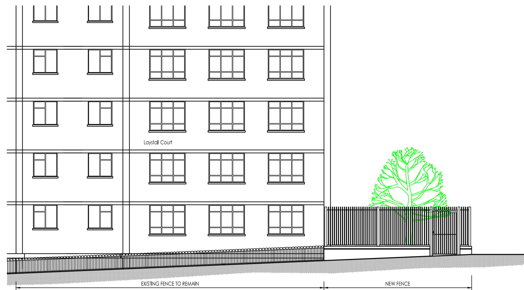
ELEVATION FROM MOUNT PLEASANT