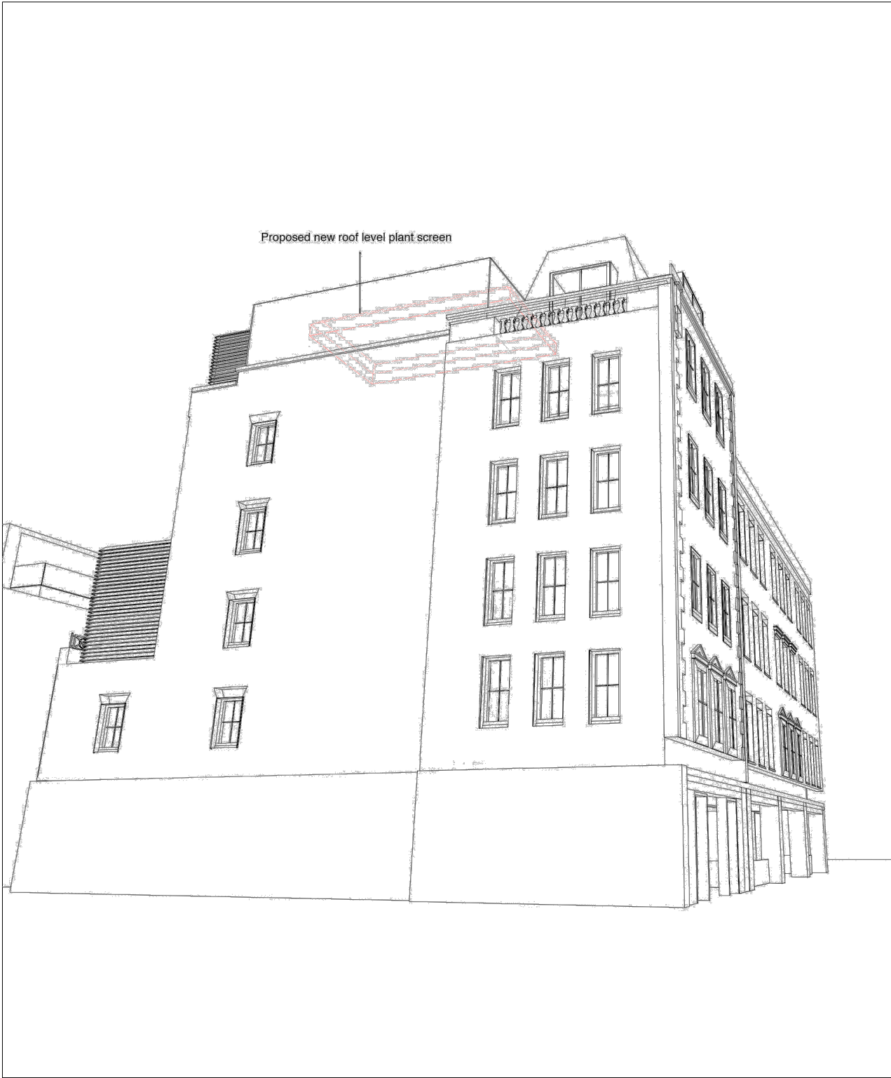
1 WINDMILL STREET - VISUAL FROM EAST SCALE NTS