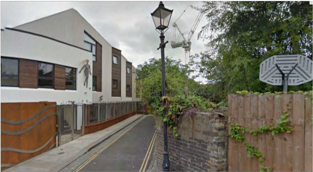
01 View down Harmood Grove to Rear of Property