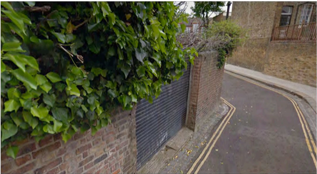
03 View of Roller Shutter Garage Door to Rear of 32 Harmood Street