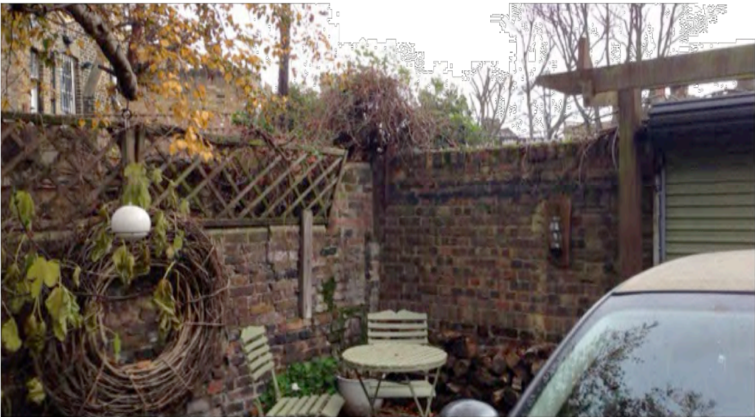
04 View of Rear Wall and Roller Shutter from garden at 32 Harmood Street