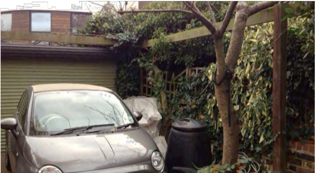
05 View of Rear Wall and Roller Shutter from Garden at 32 Harmood Street