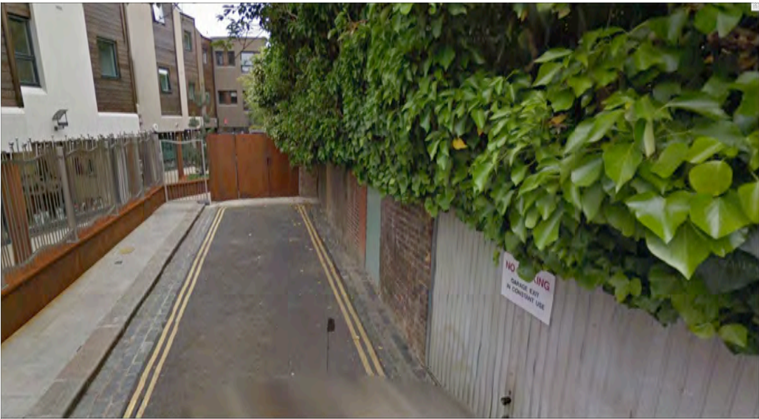
02 View of Rear Gates on Harmood Grove